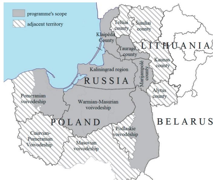
Fig. 3. The scope of the Lithuania-Poland-Russia programme for 2007—2013 [21]

After the enlargement of the European Union in May 2004, the issues of European transboundary cooperation were singled out to form the European Neighbourhood and Partnership Instrument (ENPI). The ENPI was a mechanism for developing the EU's external relations. Since 2006, EU regulations have not used the term INTERREG. However, it continued to exist unofficially as somewhat of a brand (INTERREG IV). A Russian exclave sandwiched between EU member states, the Kaliningrad region became part of the Lithuania-Poland-Russia trilateral cross-border cooperation programme for 2007—2013. In effect, due to a delay in the signing of financial agreements, the programme was approved only at the end of 2008 and launched at the beginning of 2010.