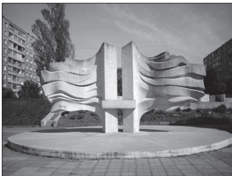
Fig. 1. Soviet-Polish friendship memorial in Kaliningrad [8]

Municipalities played an important role in the Soviet-Polish cross-border collaboration. In 1977, a Soviet-Polish friendship memorial created by sculptor E.A. Popov was ceremonially opened in Kaliningrad to celebrate the long-standing cooperation and friendship between the Kaliningrad region and the Olsztyn and Elbląg voivodeships. This partnership dated back to 1959 when Kaliningrad, Olsztyn, and Elbląg were declared sister cities [13]. Local residents and tourists visit the memorial — today, a state-protected cultural heritage site. There are two streets named after Olsztyn and Elbląg in Kaliningrad, although Olsztyn's Kaliningrad street was renamed Dworcowa (Railway Station) in the 1990s [41].