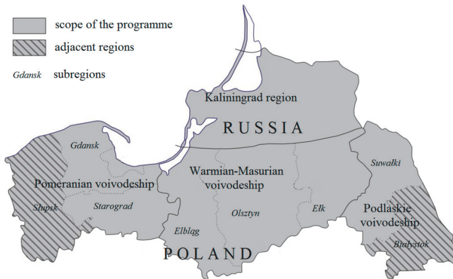
Fig. 4. Scope of the Poland-Russia programme for 2014—2020 [40]

According to the new EU financial perspective for 2014—2020, the Lithuania-Poland-Russia programme for 2007—2013 is to be divided into two programmes — Poland-Russia 2014—2020 and Lithuania-Russia 2014—2020 — in the framework of the European Neighbourhood Instrument. It is declared that, in a long-term perspective, the successful implementation of the Poland-Russia programme for 2014—2020 will contribute to closer integration of the programme territory on both sides of the Russian-Polish border. The programme includes Poland's Pomeranian, Warmian-Masurian, and Podlaskie voivodeships and Russia's Kaliningrad region. Its budget totals 61.9 million euro — 41.3 million provided from the EU funds and 20.6 million by the Russian Federation. Grants will be allocated for projects aimed at promoting local culture and historical heritage, environmental protection, improving transport and communications infrastructure, and providing assistance to border management and security. The Lithuania-Russia 2014—2020 programme was approved on December 19, 2016. Its budget totals 17 million euro [30].