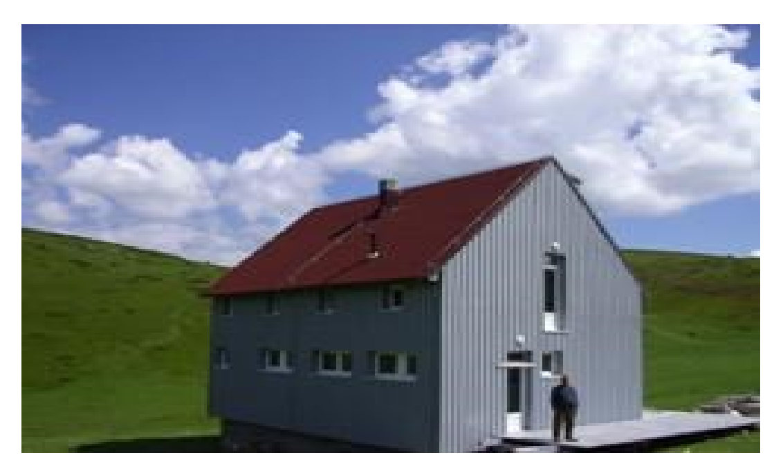
Figure 7. Mountain Krivi do - mountain hut (municipality Andrijevica) [33].