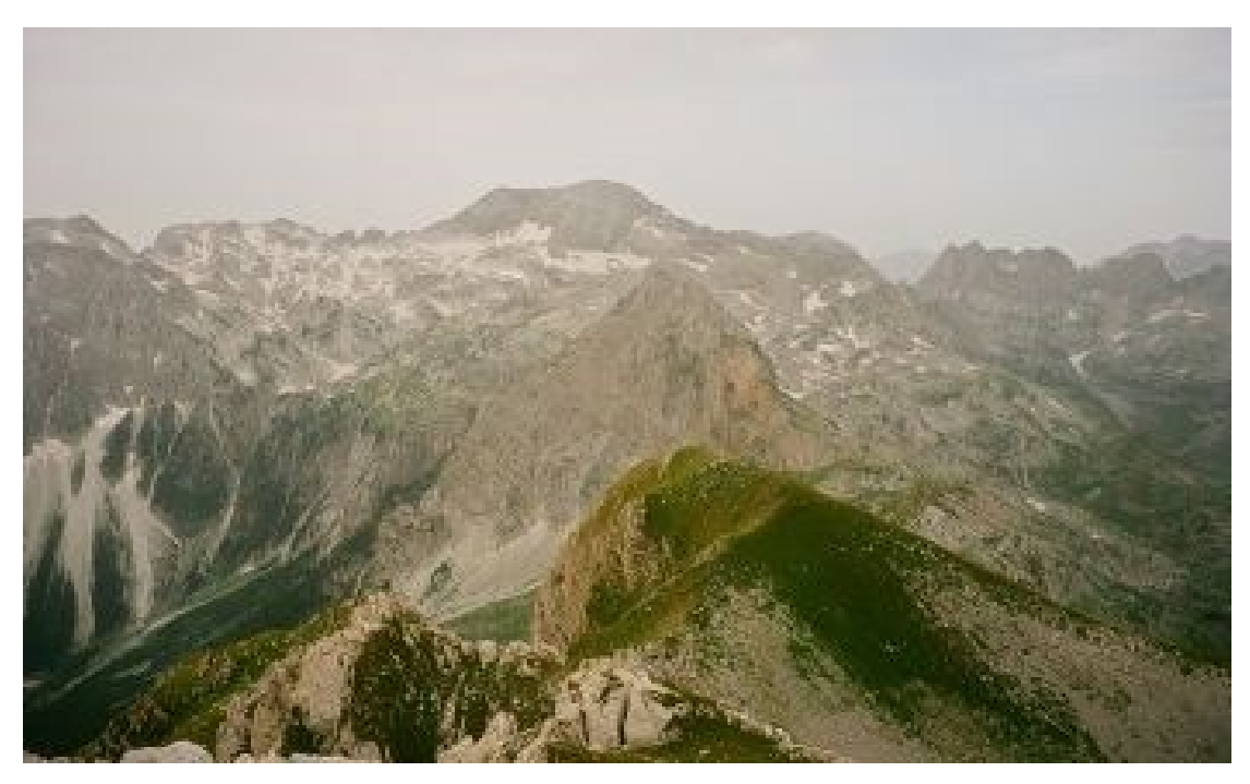
Figura 4. Prokletije - View with Maje rosit [26].