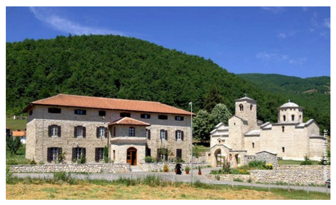
Figure 5. Monastery Đurđevi Stupovi with Berana- 2013 celebrated 800 years of existence [28].

A special group of tourist motives make the monuments of medieval church architecture (Đurđevi Stupovi monastery, the remains of the monastery Šudikovo, the church of the St. Archangel, the church of the Holy Trinity) and remains of the medieval fortress (Plav, Bihor ...). In Šudikovi, the Church Presentation of the Holy Virgin Mary founded one of the earliest written documents from these parts - "Holy-Proceedings" ("Trojica"). Modest part of the