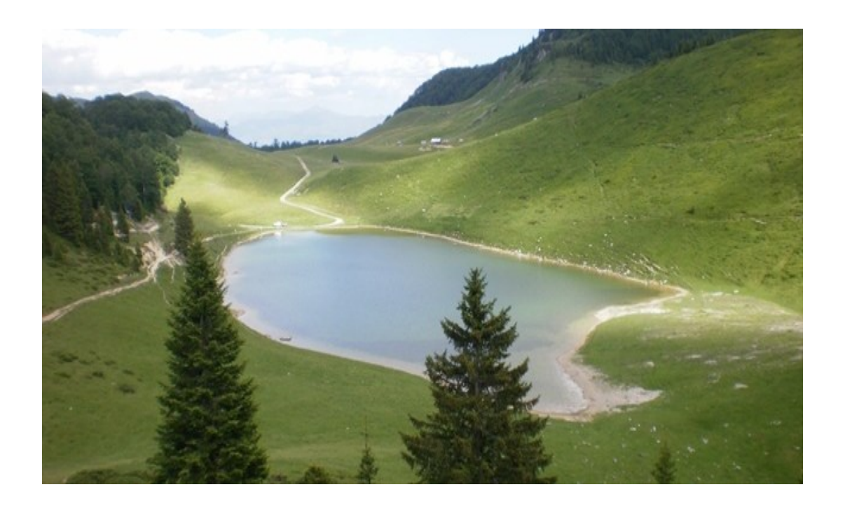
Figure 1. Bjelasica - View on Šiško Lake [23].

Their activation tourist would, for this reason, should move gradually through rural tourism, hunting and hiking, and under the influence of tourism development of neighboring regions.