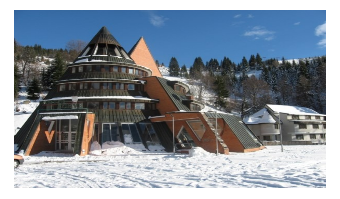
Figure 3. On the mountain Cmiljevica - findings the ski Center Lokve [25].

Tourist zone Berane, covers parts of different spatial units, each functionally related. It is made up of valleys Berane and mountains Cmiljevica. It is characterized by rich forest ecosystems, landscapes, convenient ski area in terms of the development of rural tourism. Functional connectivity of the area provides the continental part of the Adriatic Highway with transit traffic. And Berane in this zone gets the tourist office, due to transit traffic and the road through the valley of Lima, as the role of logistics support and the holder of the material basis of tourism development of the area, but also over the role of tourism in the mountainous part of Bjelasica.