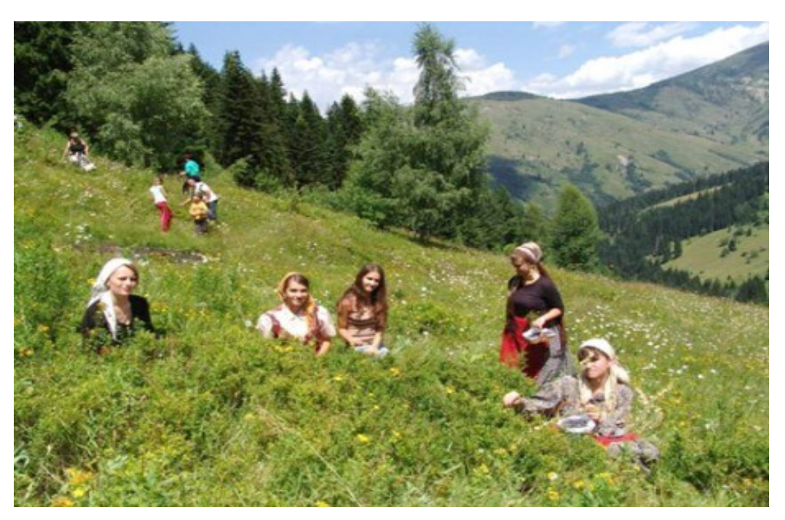
Figure 6. Days of blueberries municipality Plav - are held each year (month of July) [29].

On the contrary, these factors should certainly incorporate the contents of a tourist's stay, the more they gain in importance. According to Cooper et al [30] and Buhalis [31], the majority of tourist destinations are an amalgamation of the following components: