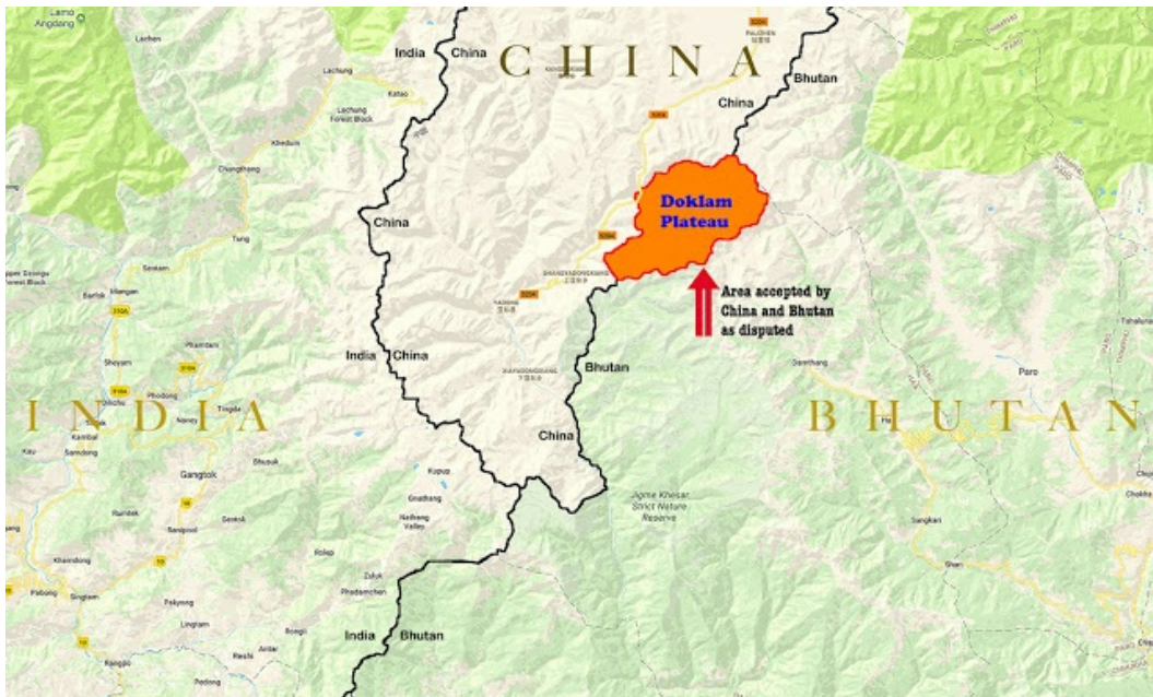
Image Attribute: Doklam Plateau, Source: Google Maps / Layered analysis provided by the author.

In June 2017, China attempted to extend a road from Yadong to the Doklam plateau southwards towards what is called the Doka La pass. However, Bhutan formally objected to China's road construction in the disputed area. As stated by the Bhutanese government, China attempted to extend a road that previously terminated at Doka La, towards the Bhutan army camp at Zornpeli near the Jampheri Ridge. What finally ensued was the standoff between the Indian and the Chinese armies respectively as Indian troops blocked the Chinese attempts to build the road. As a result of the standoff, the Chinese media started referring to the area as the tri junction, which is actually centered at a place called Gyomochen, further down of Batang-La (as outlined in the map below) which was taken as the tri junction prior to the standoff.