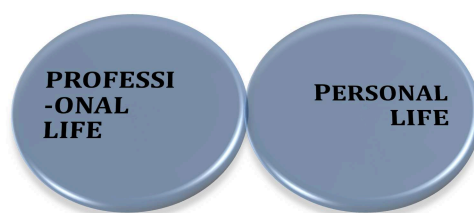
FIGURE 2: WORK LIFE BALANCE

All branches and administrative offices throughout the country sponsor and participate in large number of welfare activities and social causes. Bank's business is more than banking because we touch the lives of people anywhere in many ways. Bank's commitment to nation-building is complete & comprehensive [9].