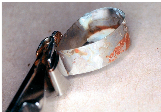
Figure 1. Visible blood contamination on a used Siqveland matrix band and retainer.

A pilot study assessed the degree of contamination of various components of the Siqveland matrix system during normal clinical use. A total of 18 matrix bands were examined, six immediately after clinical use, six following ultrasonic cleaning and six after the sterilisation process. Visible blood contamination on the outer surfaces prior to decontamination was recorded (Figure 1), together with Kastle-Meyer test results after ultrasonic cleaning and after sterilisation. The areas most inaccessible to cleaning procedures