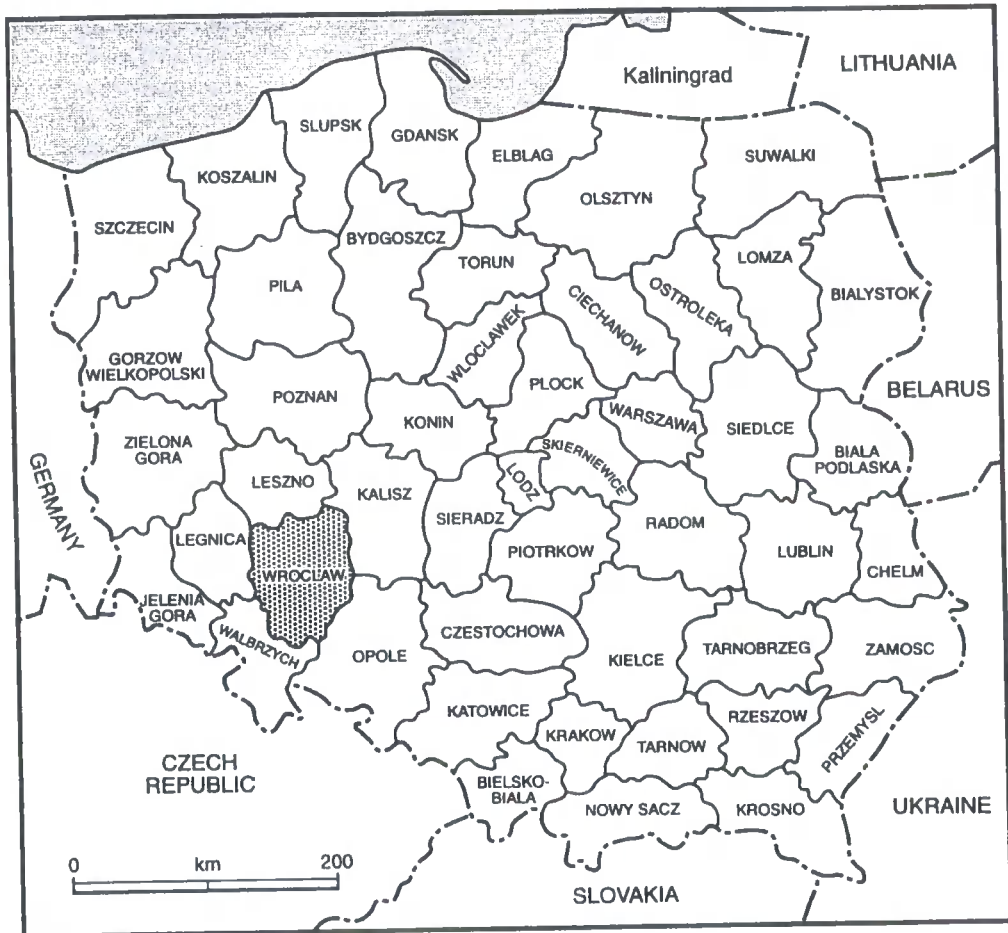
Figure 1.1 Map of Polish voivodship from 1975 to December 1998