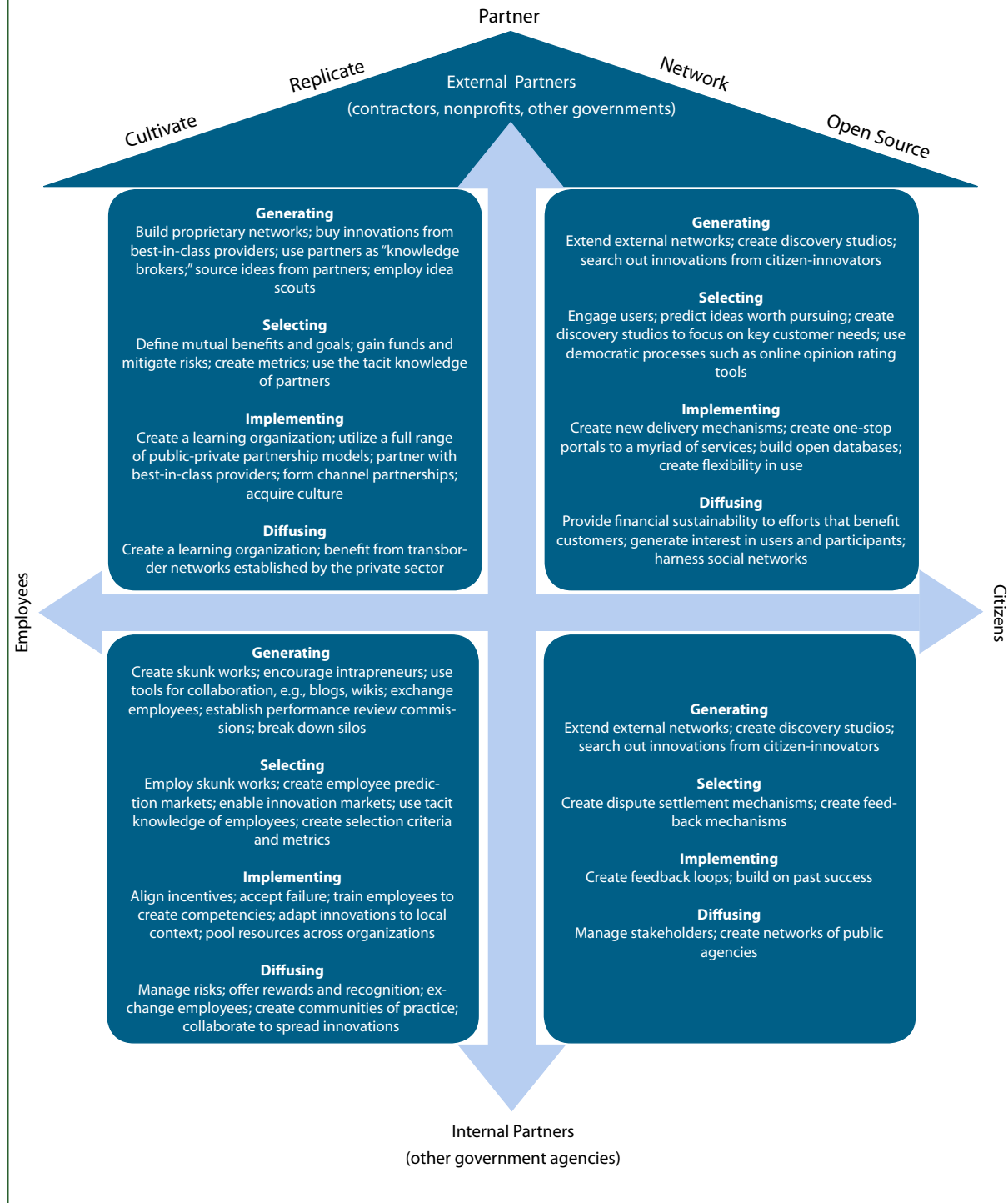
Figure 2: Tools, Methods, and Approaches to Generate, Select, Implement, and Diffuse Innovative Ideas in the Public Sector