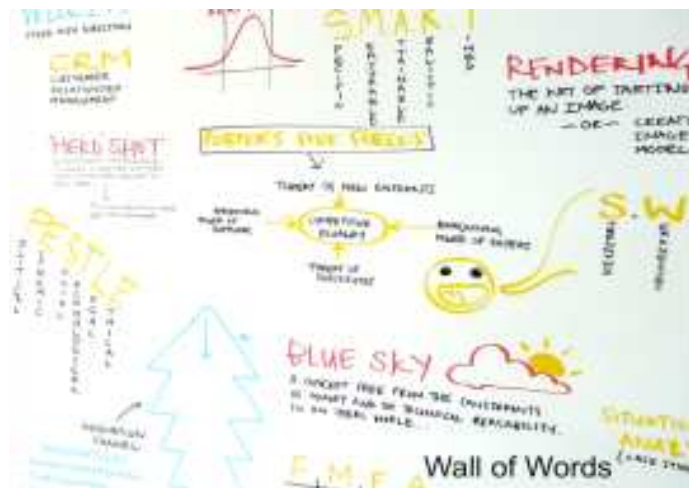
Figure 2. 'Wall of Words'

“The group provided another effective result by letting all of the disciplines have a say, we incorporated each other’s criticisms and ultimately created three concepts that all originated from different group members. The innovation we each saw here was that no-matter what the idea; each member added something to it to turn out the concepts.”