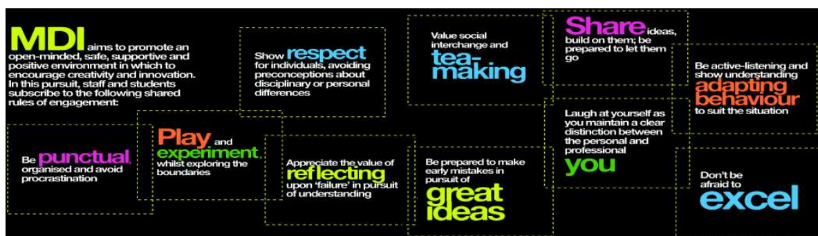
Figure 3. Terms of Engagement

We have shown how this new programme has been developed from sound principles and direct observation of multidisciplinary innovation practice in action. To date, students have worked successfully with such organisations as The MS Society, BBC, Mars, Unilever, Berghaus and Sonoco Alcore as well as a host of regional SMEs. Fundamental to sustaining this success is the honesty and commitment of stakeholders learning how to communicate and work together. We need to look to our students as partners in this research. We give them the last words as they explain through their Terms of Engagement (Fig. 4) the factors that they believe are essential to support their multidisciplinary innovation practice.