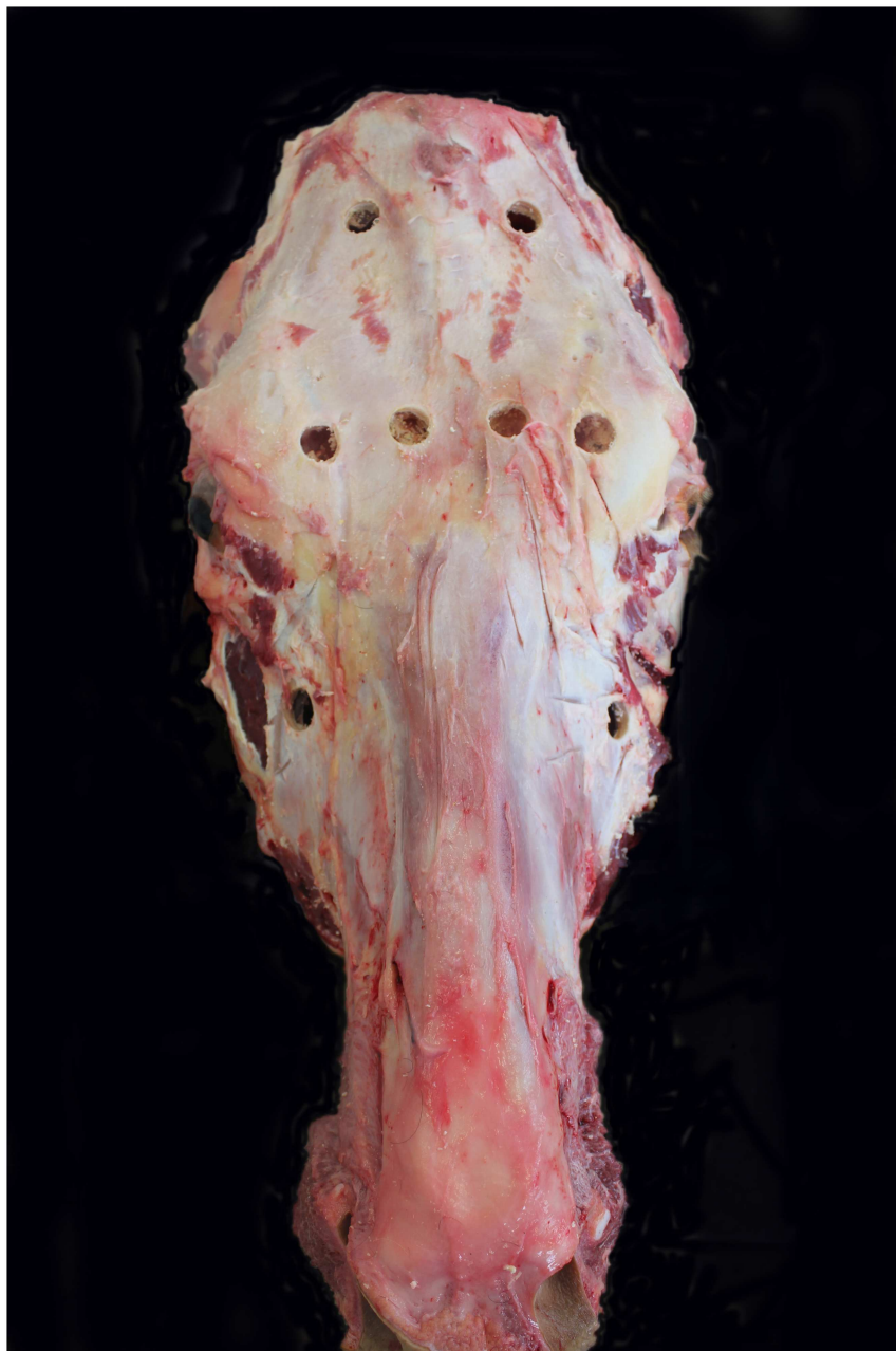
Fig 1. The eight sampling sites on the bovine head used to sample the caudal frontal, medial rostral frontal, lateral rostral frontal and maxillary sinuses on both sides of the bovine skull.