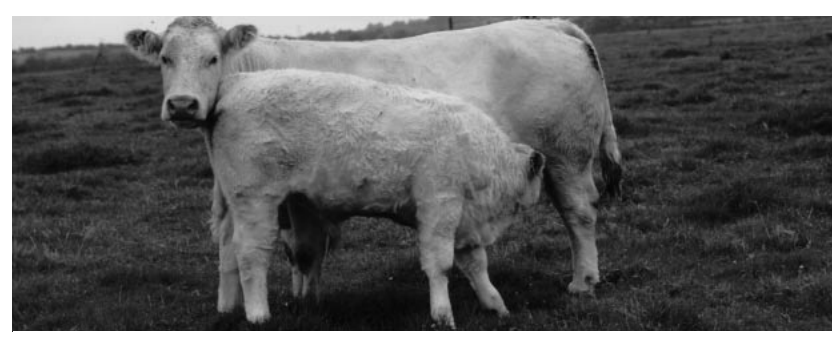
Charolais cow and her calf at pasture

Table 3. Colostrum yield, immunoglobulin concentration and total Ig mass from 1st milking.