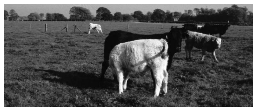
Limousine x Friesian cows and their calves