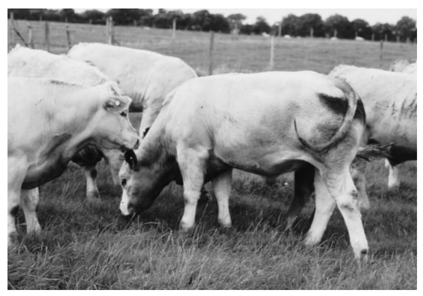
Steers Progeny at Pasture in Autumn

The mean calving dates for the Charolais and Hereford x Friesian cows were March 21 and March 9, respectively (Table 7). One factor contributing to the difference in calving date was that the Charolais replacements were younger when breeding commenced than the Hereford x Friesians. This was due to purchasing the latter replacements about mid March at 2 to 3 weeks of age while calving only commenced in mid February in the Charolais herd with some calves born in April. In this regard, there is also a breed type effect as cyclic activity commences at an older age in the late maturing beef breeds such as the Charolais than in Beef cross Friesians. In France, where purebred Charolais account for approximately half of the suckler herd of 4.2 million cows age at first calving is usually three years. The somewhat shorter calving interval in the Charolais is expected as the two cow breed types were let to pasture at the same time and therefore, the later calving Charolais were placed on a high plane of nutrition (pasture) sooner after calving than the Hereford x Friesians.