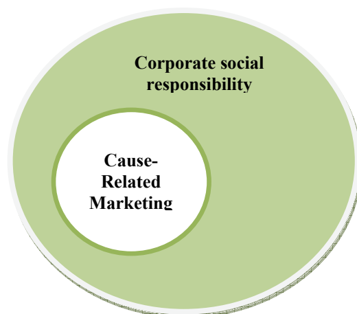
Figure no. 1: Cause-related marketing, part of social responsibility

In the UK, the Business in the Community (BITC) organization has been actively involved in working to improve standards in responsible business practice since its inception in 1982. Its member companies are committed to using best practice in order to make a more positive impact on society, and this takes the form of specific initiatives including cause-related marketing campaigns as well as considering the wider aspects of corporate social responsibility. Business in the Community (2004) defines cause-related marketing as: " A commercial activity by which business and charities or causes form a partnership with each other to market an image, product or service for mutual benefit. "