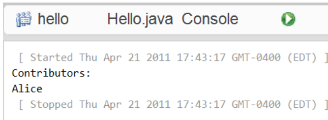
Figure 4: The output from running the program after Alice and Bob’s collaboration: changes on lines 3 and 4 are integrated, but the unfinished line 5 exists only in Bob’s working copy.

Once each of them completes edits that can be introduced to the project error-free (3b-c), those edits are applied to the version on disk. Then, even though one of Bob’s changes still has errors, this does not affect either programmer’s ability to run the project and debug their code (Figure 4). In this case, even though Bob began working first on line 5 and abandoned that work in progress to make a critical change on line 3, that completed change is not held back by his incomplete earlier work, and he needs to take no extra steps to share only the working contribution.