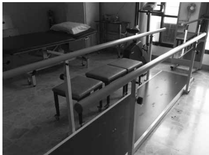
Figure 4: Parallel bars for walking and gait training.

As Figure 6 demonstrates, renal function plays a part in the conversion of 25-(OH)D to the active form 1,25-(OH) 2 D. This ability diminishes at an estimated glomerular filtration rate (eGFR) <30ml/min/1.73m 2 and leads to impaired hydroxylation of vitamin D. Secondary effects include: raised parathyroid hormone (PTH) levels, reduced intestinal calcium absorption, reduced phosphaturia, and reduced calcium urinary reabsorption. PTH, calcium and phosphate should be measured to reflect this deficiency. The cardiovascular, biochemical, endocrine and bone mineral disorders that develop secondary to renal impairment were coined 'Chronic Kidney Disease-Mineral and Bone Disorder'. 'Renal osteodystrophy' is restricted to describing an alteration