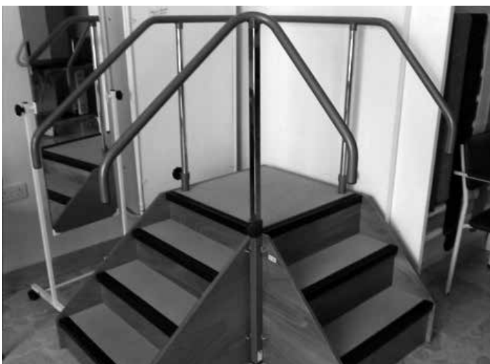
Figure 5: Training stairs used for lower body co-ordination and balance.

There are conflicting recommendations when it comes to starting treatments. The NOGG (2016) deemed treatment be considered in those above the intervention threshold