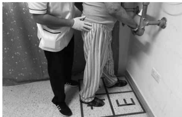
Figure 2: Lower limb proprioception exercise.

In 1994 the World Health Organization (cited by NOGG, 2016) described osteoporosis as a 'progressive systemic skeletal disease characterized by low bone mass and microarchitectural deterioration of bone tissue, with a consequent increase in bone fragility and susceptibility to fracture'. 'Osteoporosis' is defined operationally as a value for BMD that is 2.5 standard deviations (SD) or less below the young adult mean value (T-score \leq -2.5 SD). Lorentzon and Cummings (2015) however concluded that no perfect definition yet exists that can ascribe to the properties of fragile bone measured in terms of bone strength, risk factors and prior fractures. 'Severe osteoporosis' refers to the above and an additional