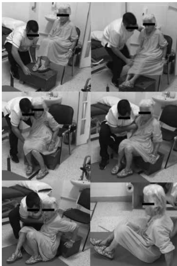
Figure 1: Fall management exercise.

Excellence management guidelines are discussed in this regard. Treatments ranging from fall prevention, dietary modification, anti-resorptive therapy and tailoring of treatment in subgroups were reviewed.