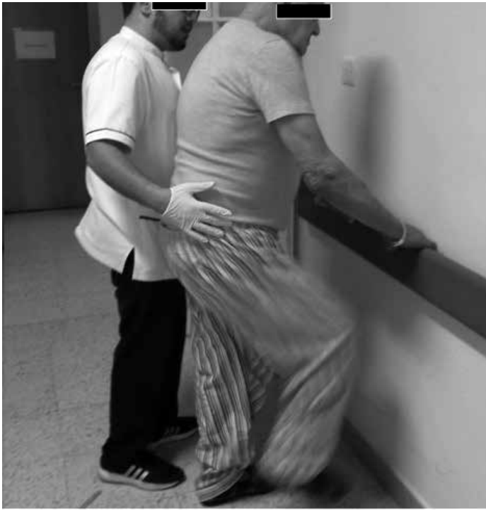
Figure 3: Stepping exercise.

documented fragility fracture. A higher threshold describes 'low bone mass' as a T-score that lies between -1 and -2.5 SD (NOGG, 2016).