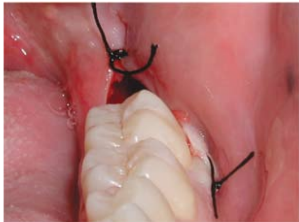
Fig. 2. Closure by approximation of wound margins. Technique 1 (healing by second intention).