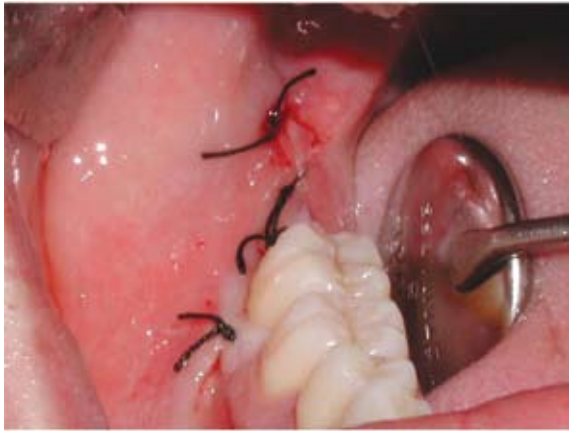
Fig. 1. Closure by flap repositioning. Technique 2 (healing by first intention).