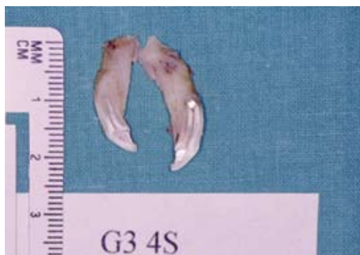
Fig. 1. Macroscopic section of the periapical area with silver amalgam (Hematoxylin-eosin, x10).

Sagittal sections were cut along the longitudinal axis of the teeth, to facilitate examination of the retrograde filling and periapical area (Figure 1).