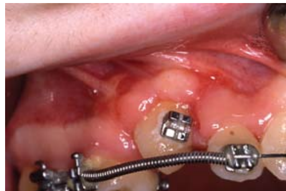
Fig. 3. Erupted canine with attached gingiva at its cervical area.