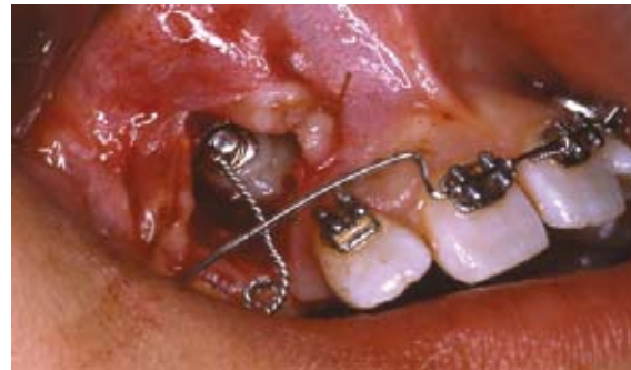
Fig. 2. Flap sutured to place after meridian incision.