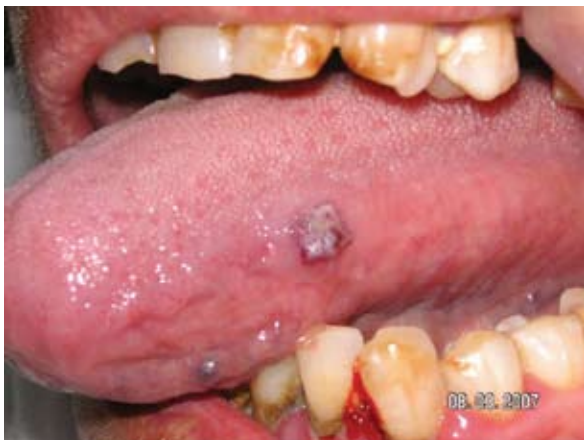
Fig 1. An erythematous papule over the left lateral surface of the tongue.

On dermatologic examination, no angiokeratomas were found anywhere on the skin.