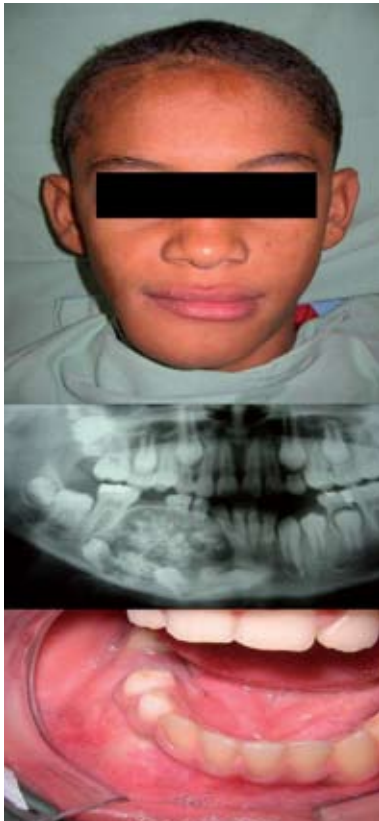
Fig. 1. (Above) Extra-oral examination showing a swelling on the right mandibular body, of hard consistency on the palpation, which caused moderate facial asymmetry. (Middle) Panoramic radiography exhibiting in the right place of mandible a well circumscribed lesion with scattered foci of calcified material which contained several radiopaque bodies of varying sizes and shapes. (Below) Intraoral examination revealing a tumoral mass with great cortical bone expansion, covered by normal mucosa with discrete displacement of neighboring teeth.

able, as were the results of a review of systems and a physical examination. Extra-oral examination showed a painless swelling on the right mandibular body, of firm consistency on the palpation, which caused moderate facial asymmetry. Intraoral examination revealed a tumoral mass with great cortical bone expansion, covered by normal mucosa measuring 4.0 x 2.0 cm, located on both the lingual and vestibular faces of the right body of the mandible, with discrete displacement of neighboring teeth. Panoramic radiography exhibited an expansile, radiolucent, well circumscribed lesion with scattered foci of calcified material which contained several radiopaque bodies of varying sizes and shapes. The right lower canine, right lower first premolar and right lower second premolar had been displaced inferiorly at level of cortical basal of the mandible, whereas that the right lower canine and right lower first molar (both deciduous) showed the roots reabsorbed, and the adjacent permanent incisors displayed their roots displaced in medial position. These findings are illustrated on Figure 1. The provisional diagnoses were odontoma or