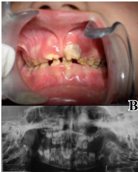
Fig. 2, a, b: Dental panoramics and clinic photos taken by 2 patients.

Uriner system graphy of one patient and renal ultrasonography of 5 patients demonstrated suspicious radiopacity. Laboratory results of 3 patients showed low Ca values (100-300 mg/days) and 2 patients showed low P values (0,4-1,3 g/ days) (Table 1, Fig. 2A and B). In this group, 2 of them were occurring in a sibling pair. Although siblings showed common oral findings, other 3 patients had different symptoms. These groups were followed up by nephrology departments.