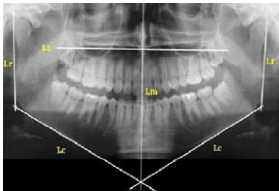
Fig. 1. Reference lines.