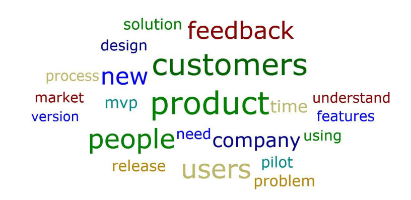
Figure 1. Adjusted (limited) word cloud based on all 6 interviews.<sup>1</sup>

Four interviews were conducted live and two were conducted over the Internet with the video chat service Skype. All interviews were audio recorded with permissions of the interviewees. The most essential and relevant information was also taken as short notes during the interviews as a precaution measure.