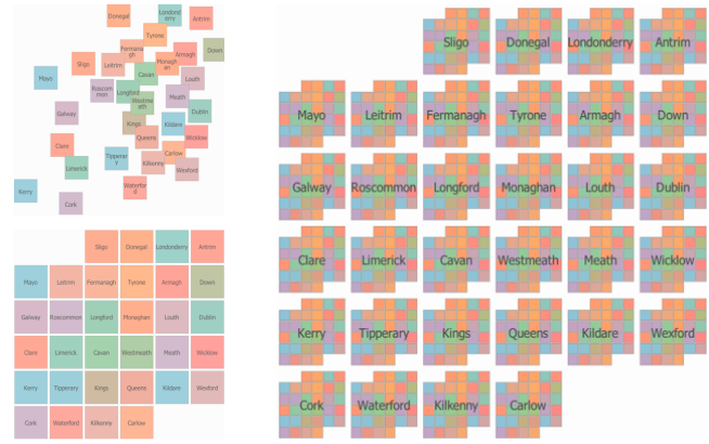
Figure 1: Constructing an OD Map. Top left : The 32 counties of Ireland as squares in their true geographical positions. Bottom left : Counties moved such that they tessellate into a grid, with approximate geographical positioning. Right : OD Map, where original squares represent origins, into which we have nested a mini map of destinations with exactly the same layout. Each cell represents an origin-destination pair. Colour indicates county. This is also illustrated in our video at http://vimeo.com/45078794 .

OD Maps [6] rely on a square base-map comprising all the discrete locations (origins/destinations), spatially-arranged into a tessellated