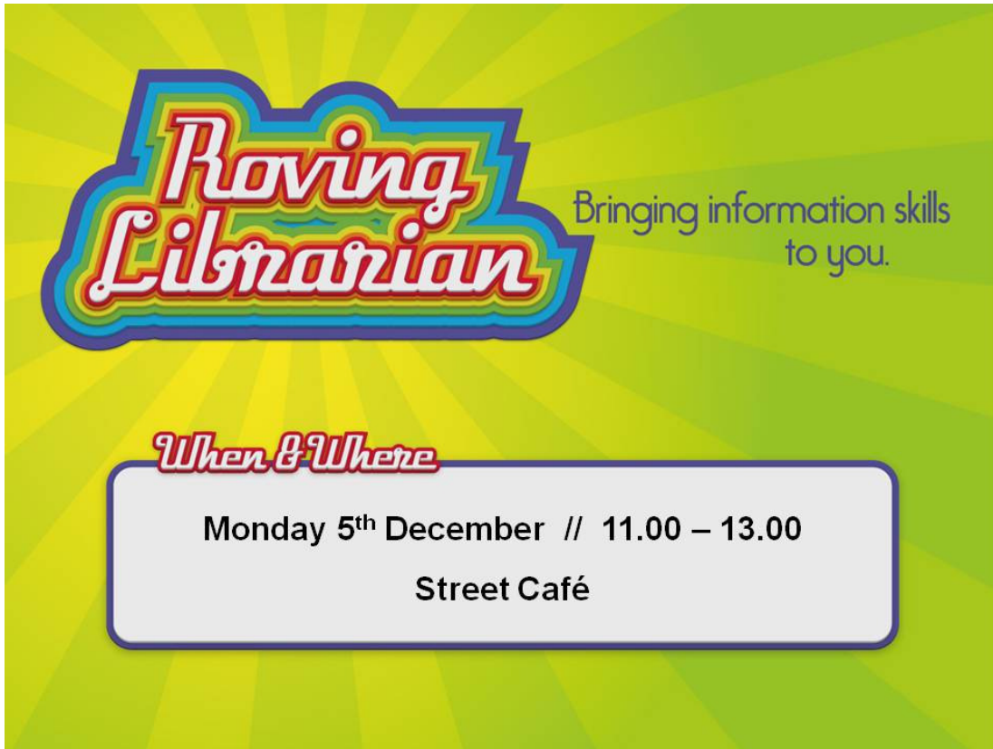
Figure 5.2 Poster advertising a Roving Librarian session in the Business School