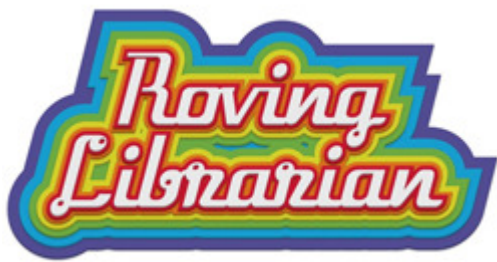
Figure 5.1 Roving Librarian logo

For the project to be a success, it needed a distinguishing brand. We felt that a librarian out of context may not be recognized. A logo or strong image that students can associate with the Roving Librarian was required. We liked the concept of “Martini information literacy” with its suggestion of information “anytime, anyplace, anywhere,” 16 which we felt nicely illustrated the roving service we were providing. The original idea was for the design of a female librarian on roller skates closely resembling the woman in the Martini advertisement, but instead of holding out a tray of drinks, she would be balancing a tablet computer on her open palm. However, we could not locate a suitable image but very much liked the retro design of the words Roving Librarian produced by our graphic designer (figure 5.1).