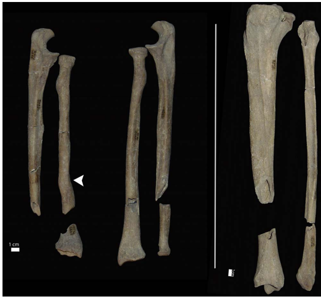
Fig. 4. Skeleton RMPE 117 shows bilateral evidence of a cut affecting the upper limb (distal portion) and distal portion of the left tibia and fibula. It is also evident a callus of a remodeled fracture in the diaphysis of the left radius (arrow head).

they were fragmented or incomplete at the time of laboratory data collection.