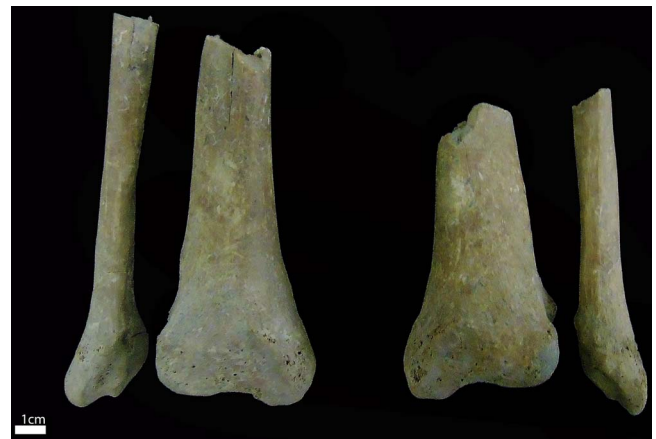
Fig. 2. Oblique cuts in the distal third of the diaphysis of the fibulae and tibiae noticed in the skeleton RMPE 116.

Skeleton RMPE 116 exhibited morphological features compatible with a male individual based on cranial and pelvic morphology, and it is the youngest of the three individuals. Third molar root apices were still open (Mincer et al., 1993), the distal epiphyses of the ulna and radius were not completely fused, and the distal epiphyseal line of the