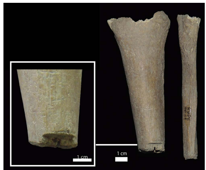
Fig. 5. Right fibula and tibia showing evidences of cut observed in skeleton RMPE 118. A false start is noticed in the tibia.

Except for the lesions in the forearms and leg bones, no other evidence of perimortem trauma was found in the skeletons surveyed. Cut marks on the distal extremities of the forearms and lower leg bones, with severing of hands and feet, suggests an amputation of the extremities likely happening around the time of death. The lesion's features suggest that these are compatible with the action of a sharp