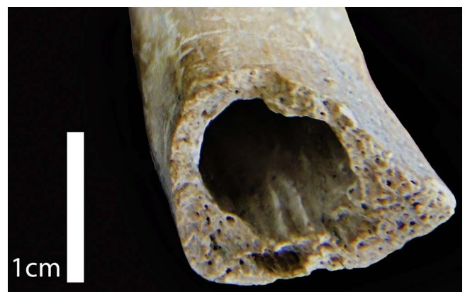
Fig. 3. Striations parallel to the kerf floor in the right distal extremity of the fibula, observed in the skeleton RMPE 116.

Skeleton RMPE 117 had most of the bones present (Fig. 1), however