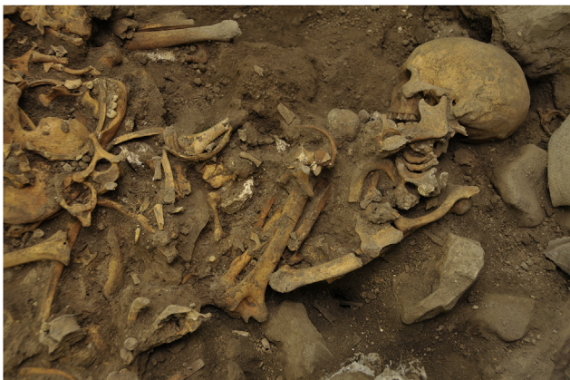
Fig. 3. Chalcolithic collective burial (MIR203).

On the other hand, the analysis of DNA of these individuals has provided important information about this human group and its relationships with other contemporary and previous groups (Mathieson et al., 2015). The mitochondrial DNA sequence and the haplogroup composition of 19 individuals from the collective burial has been obtained (Gómez-Sánchez et al., 2014). This work is related to the analysis of the current distribution of haplogroup H that was modeled by the expansion of the Bell Beaker culture out of Iberian Peninsula during the Chalcolithic period. However, little is known about the genetic composition of other contemporary