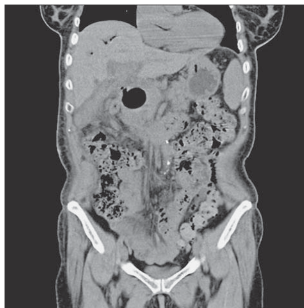
Fig. 3. Multi-slice computed tomography of the abdomen performed with contrast.

Even though our patient had a biliary type II cyst which, like type III, has a low malignant alteration potential and does not require complete excision 2,3 , in