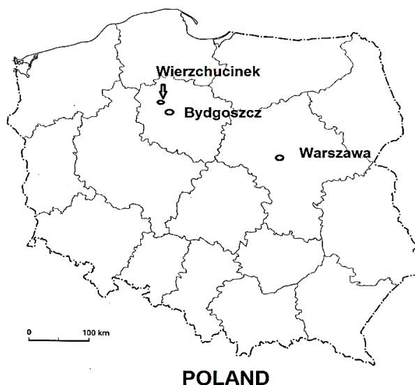
Figure 1. Location of experimental station - kujawy pomeranian region – Poland

Rysunek 1. Lokalizacja stacji badawczej – woj. kujawsko-pomorskie - Polska