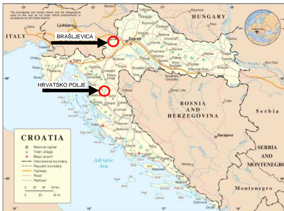
Figure 1. Map of Croatia with highlighted locations of investigation (Brašljeвица and Hrvatsko Polje)

A field fertilization trial with beetroot ( Beta vulgaris var. conditiva Alef.), cultivar 'Bikor', was carried out in Brašljeвица and Hrvatsko Polje (Croatia) (Figure 1) from 2003 to 2005 (Brašljeвица in 2003, B-2003; Hrvatsko Polje in 2004, HP-2004 and Hrvatsko Polje in 2005, HP-2005) using the Latin square method with four treatments (unfertilized control, 50 t stable manure*ha -1 , 500 and 1,000 kg NPK 5-20-30*ha -1 ). Untreated beetroot seed was sown (22 nd May 2003, 21 st May 2004 and 29 th June 2005) directly into soil with a plant spacing of 0.07 m x 0.4 m and a main plot area of 12 m 2 . Beetroot were harvested (21 st Aug 2003, 24 th Aug 2004 and 28 th Sep 2005) after ~90 days.