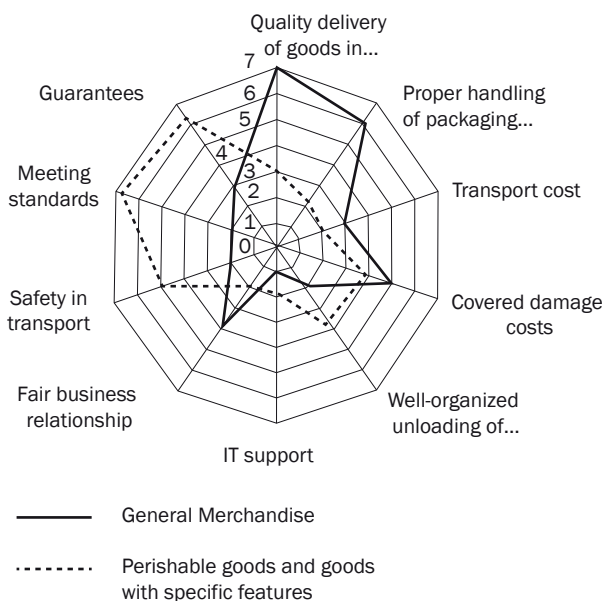
Figure 2 – SP 2 - Schematic presentation of corporate responsibility in road freight transport (FMCG retailers)