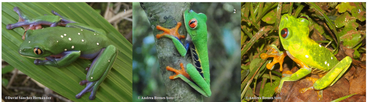
Fig 1. Species and groups of the study. 1: A. annae , 2: A. callidryas Atlantic population, 3: A. callidryas Pacific population.

The collection of the animals began after 19:00 hours. Animals were found near ponds and localized by identifying the male's song, after a period of recognition training. All the procedures for collection, handling and management of the animals were standardized in order to avoid a possible bias due to stress. Frogs were collected by hand, wearing nitrile gloves, and individually maintained during the night in 10\text{ X }10\text{ X }15\text{ cm} plastic containers containing a