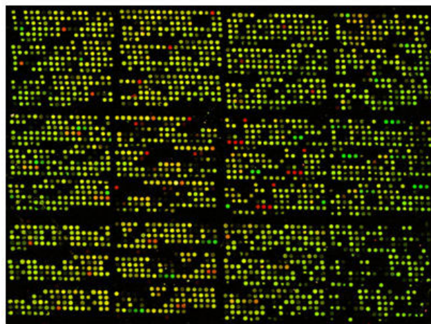
2 N. lactamica strains