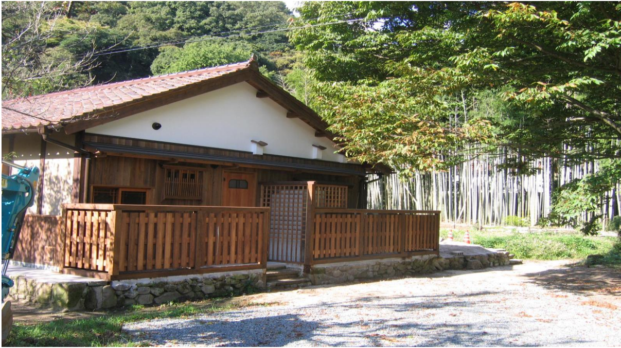
Figure 33: Remodelled home, heat pump behind wooden grill; bamboo grove to right

True retro, therefore, is always a blend of elements. It may not be possible to recreate entirely the former world, nor is it desired. The idea of what represents an older tradition can be contested or misunderstood. Baudrillard (1994: 44) underscores the mixed nature of retro, but associates it with the longing for something real even as it drains the subject of meaning. As can be seen from the above examples, the “real” part of a retro presentation may be a very superficial gesture overwhelmed by other considerations and thoroughly de-contextualized. The “real” tends to be related to the immediately preceding era, and therefore, when retro-chic became a common fashion movement in the late 1970s, it was perceived as a (hostile) response to the counter-culture of the previous decade. Lippard (1996: 12) argued that it was closely related to punk, and both styles represented a sexist, racist and classist turn in US culture that coincided with the Regan era in politics. Retro-chic at this time was an attempt to be outrageous and to shock with excess. This excess of fashion represents the textbook case of victimization when adopted unconsciously (Schiemer 2010: 86), and ‘bad taste’ as something that obviously lacks proportion or is out of place (Eco 1989:180).