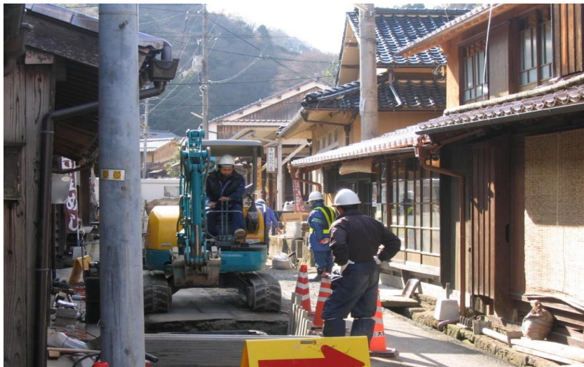
Figure 10: Burying utility lines, Ōmori