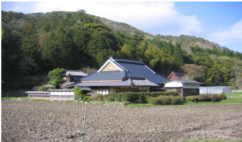
Figure 25: Maruyama, Tanba-Sasayama, Hyōgo

brochure of the hamlet invites guests “to experience for a moment the good old days, living in an old farmhouse that has rejuvenated a marginal village.” 212 The Maruyama project illustrates the difficulty of determining appropriate pricing for such luxury destinations that offer a special experience for urban visitors but not in a famous place that is known for its exclusivity. This is a good example of how the place branding has been skewed towards a status dimension that was not obvious given local resources. It is not clear how conscious the hamlet was about the marketing implications when they decided pricing. Visitors here, as in Ōmori, are sometimes perplexed at the cost of food and lodging when it is not provided by a well-known establishment, and is in an obscure location. At both Maruyama and Ōmori, pricing is based on the value which the local owners perceive, rather than on a marketing strategy that seeks to build reputation or compete with other venues. In both cases, because local businesses believe their place is unique, they cannot compare its price to those in other locations. People in Ōmori repeatedly say they have no clue on how to price goods and services for outside consumption.