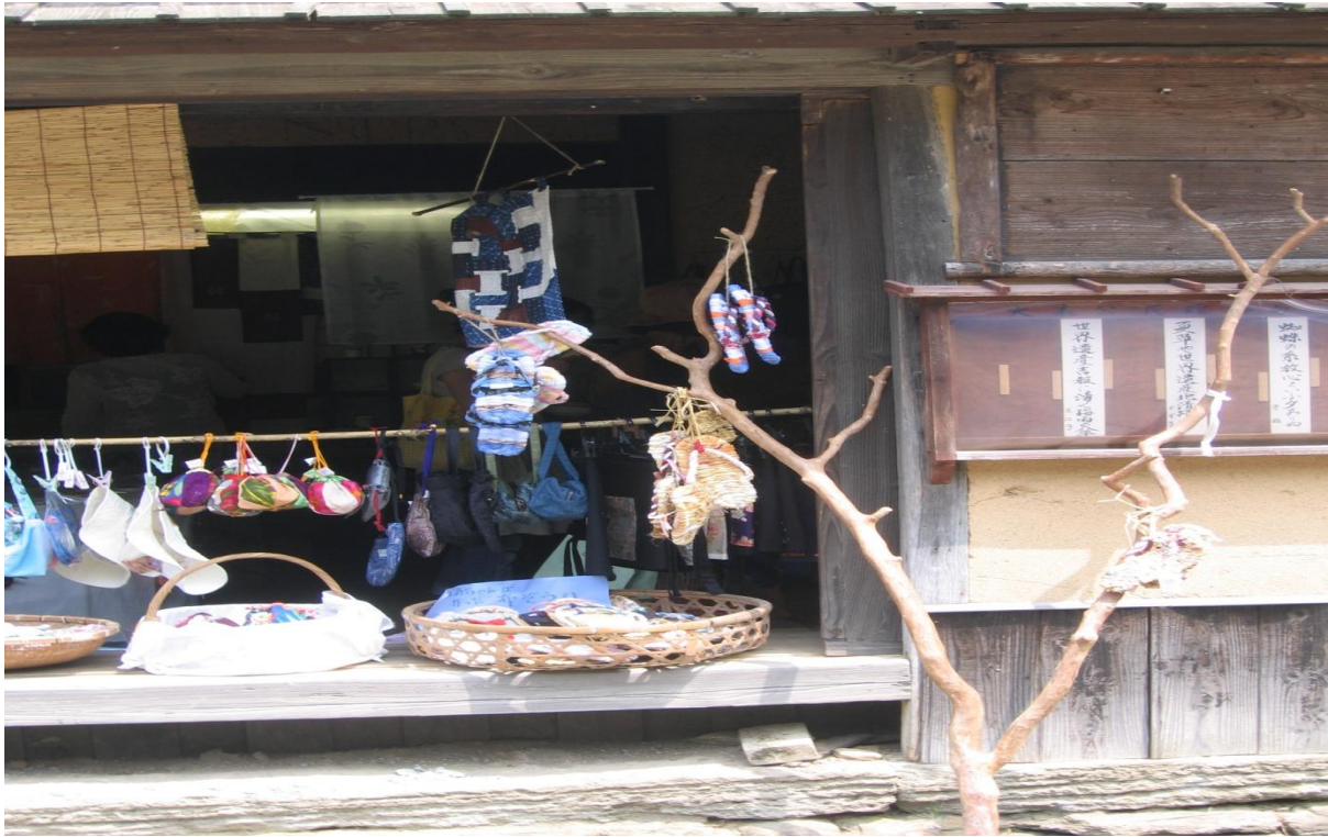
Figure 29: Handmade waraji still for sale, souvenir shop, Ōmori, 2008