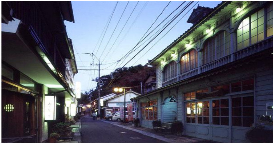
Figure 22: Preserved main street, Yunotsu, public bath on right

parking lot, was designated an Important Preservation District for Groups of Historic Buildings, and in 2009 applied to extend its scope to include the harbour. 198 The goal of these developments was to attract tourists to the inns clustered around the two bath houses in the