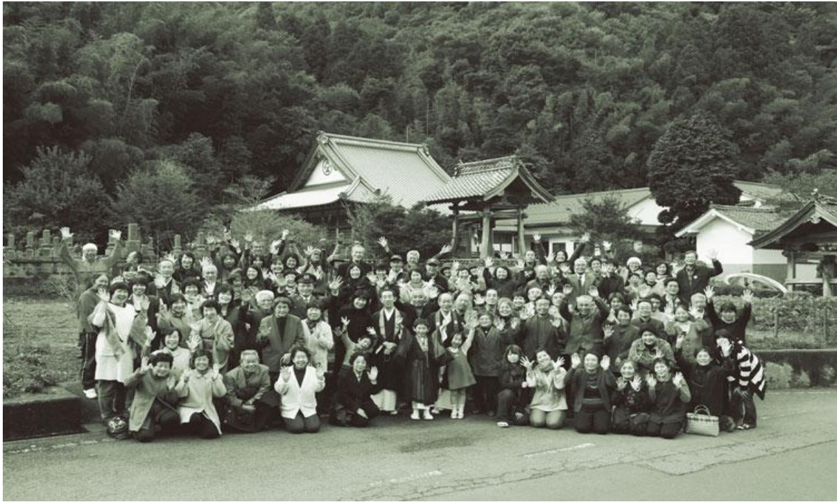
Figure 26: We are here! Ōmori 2010 calendar photograph

relatives at New Year's as a greeting and reminder of village life, which persists alongside the new realities of the World Heritage designation and its different definitions of cultural property. The calendar has purposely been designed to present a community identity, where members gather together for both formal and informal socializing.