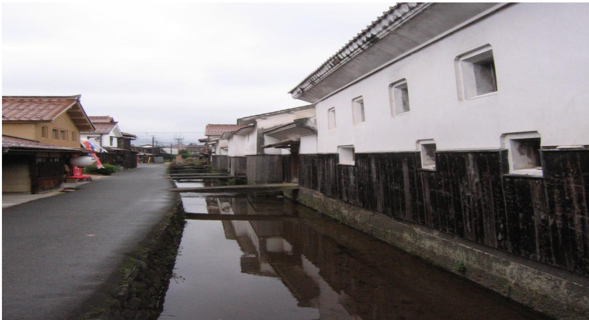
Figure 2: Historic preservation zone, Kurayoshi, Tottori Prefecture

as at June 2011, administered by a separate part of the Agency for Cultural Affairs within the national cultural property scheme. 84