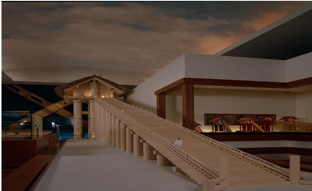
Figure 6: Replica of Ancient Izumo Shrine (Ancient Izumo Museum of History)

obtained, in some cases, at the architecture departments of certain universities. Therefore, only those with access to such reviews can get a glimpse of the internal workings of how a restoration project is conducted. This system of training and supervision produces a close-knit community of architects who have shared experience and understanding about preservation methods; it is virtually a closed guild with its own esoteric knowledge.