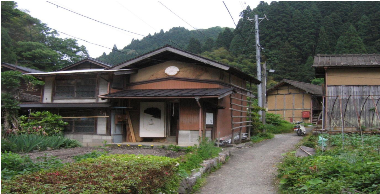
Figure 28: Main street, Itaibara, Tottori

this has had. Residents say it became too expensive to re-thatch roofs several decades ago, and the general impression is that the forest is gradually engulfing the place.