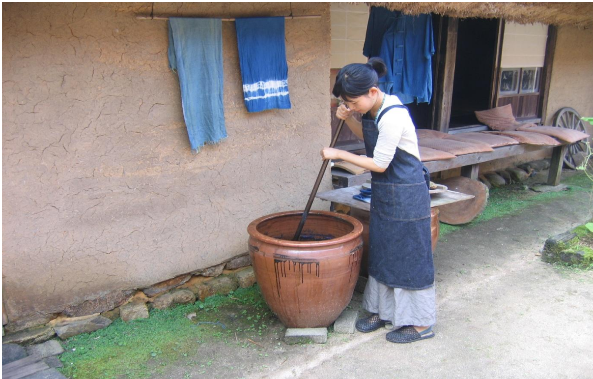
Figure 30: Mixing indigo dye for aizome (藍染め)

practices of work, leisure and relationships may be generated” (Parkins and Craig 2006: 39). To advance such subversion, the company invites selected customers for all-expense paid visits to Ōmori, in which they tour the town, eat meals and exchange views on urban versus rural life. While this program, which brings several guests a week during good weather, is a form of loyalty marketing, the purpose is partly educational. The company believes customers must experience the local life, even if only for a few days, in order to understand the possibilities of doing things a different way.