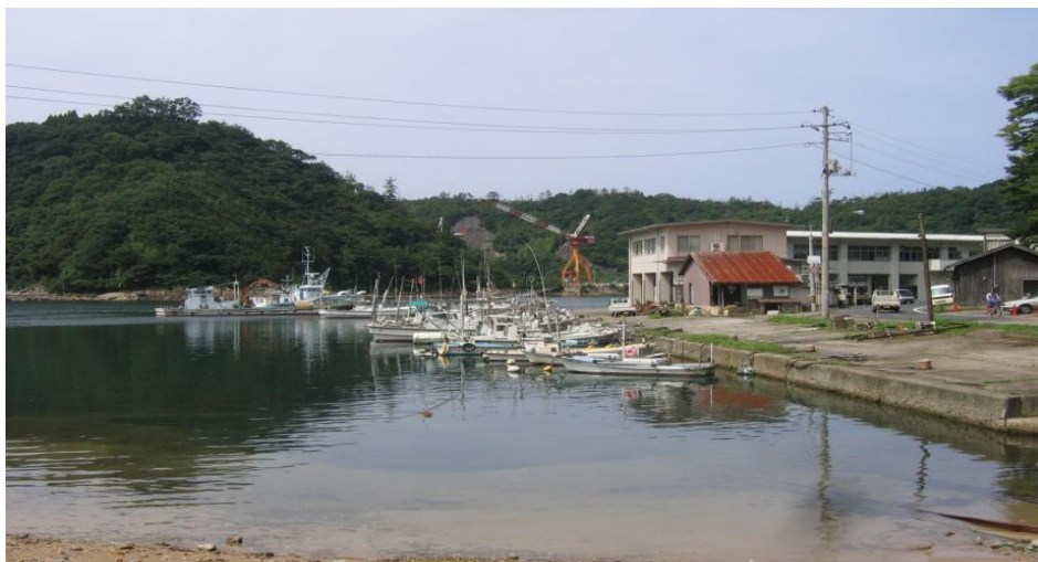
Figure 23: Yunotsu harbour, fishing co-op buildings

hot spring. Yunotsu has experienced a boom in tourist business since the 2007 listing of the area as part of the World Heritage district. Its fifteen inns are now mostly filled during the warmer months, mostly because they are the only places to stay within a forty-five minute drive of the silver mine site. JTB tours (the largest tour operator in the country) use the