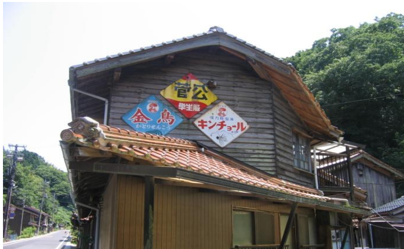
Figure 15: Old signs, Ōmori – mosquito coil advertisements

regime, such as in residential associations (Ostrom 1990: 8-12). But since Japanese case law has consistently ruled that citizens do not have a right to any particular form of environment, how can greater regulation be sought? The case of self-regulation through social suasion and multi-generational concensus as achieved thus far in Ōmori is another instance where free-riding has been successfully monitored as a spirit of cooperation evolved. The small size and relatively stable population base of the village undoubtedly were important in achieving such mutual understanding.