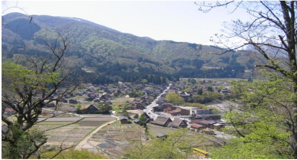
Figure 18: Shirakawa-gō, the view

1994: 26). 175 The Japanese landscapes of rural communities are the optimistic alternative, representing a return to the simpler past rather than a self-reinvention to a new life. The rural panoramas match Appleton's (1996) 'prospect' category of landscape type, and the Japanese cases also fit his 'refuge' category. Viewers are able to survey territory and have a place to retreat if attacked; they draw you in to a comfortable place where you can relax. Such empty scenery ( karappo-no fūkei ) could be anywhere -- although it happens to depict unique locations recognized by UNESCO as having universal human value.