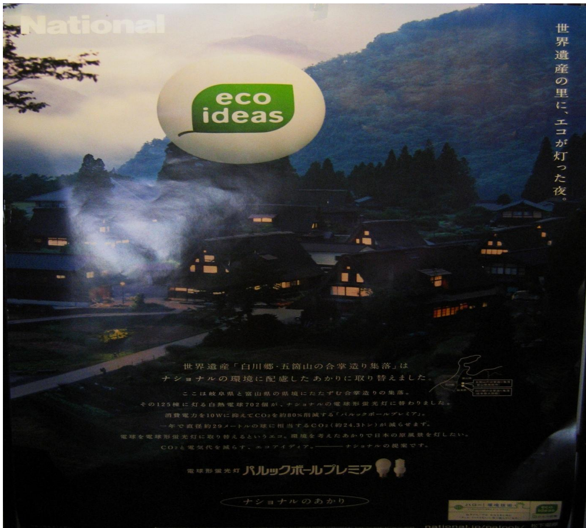
Figure 31: Matsushita Electric poster about lighting, Shirakawa-gō

Attitudes towards temperature, lighting and wild things tend to differ remarkably between urban and rural residents. Kon (1999: 29-30) begins his classic book on Japanese vernacular architecture with the statement “people who are used to living in cities really cannot imagine the homes of country residents.” 281 This is true nearly ninety years after he wrote it. Although technology allows the construction of uniformly bright, heated, antiseptic space, this is not a priority for those accustomed to relatively cold, dark places that merge seamlessly into the natural surroundings. Urban guests staying at the French family note with dismay that the bamboo grove attracts wild boar ( inoshishi ) who noisily root around in the early mornings.