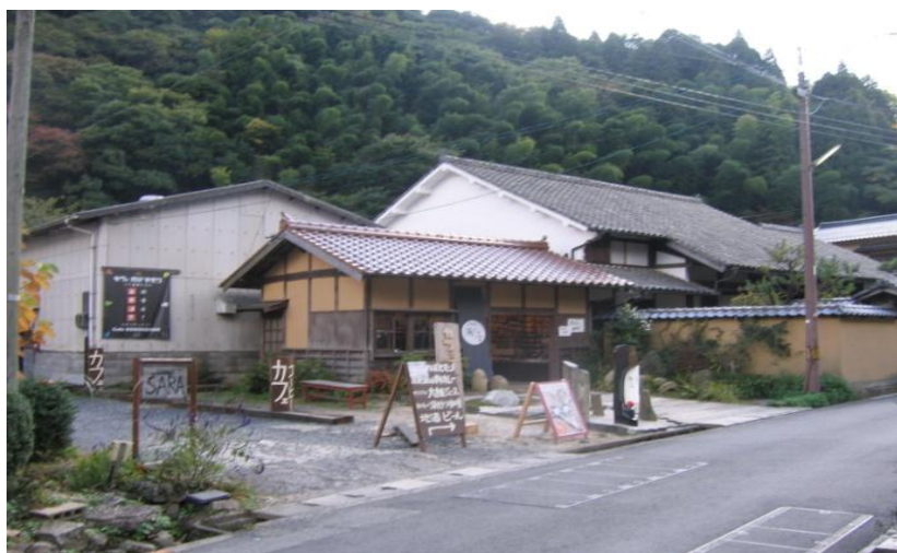
Figure 16: New signs, Ōmori -- cafe and gift shop on main street, mid-preservation zone