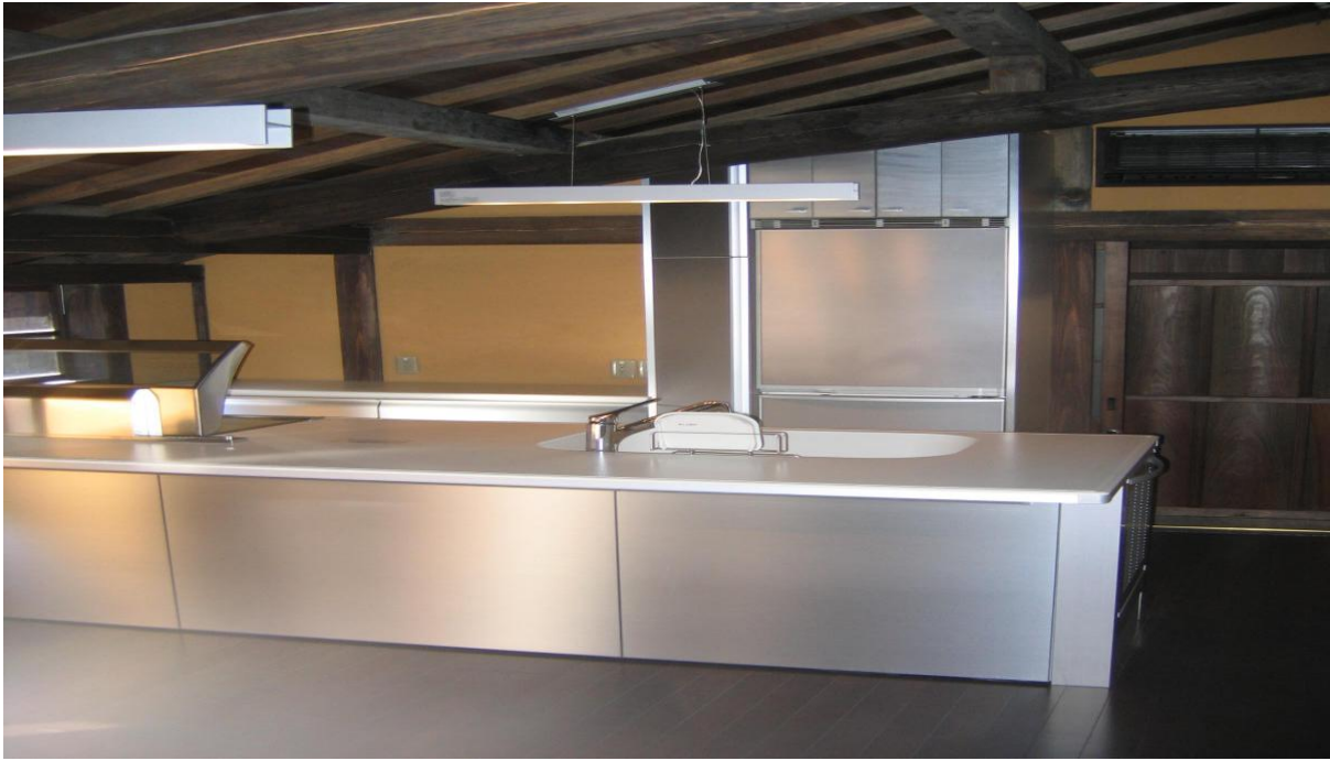
Figure 32: Chūgoku Electric Power model kitchen in Ōmori