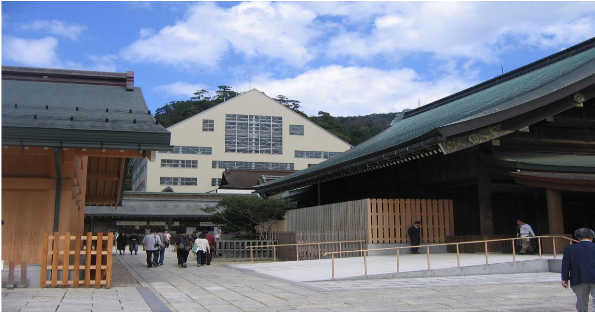
Figure 5: Grand Shrine of Izumo under repair (October 2009)

The deity spirits were moved to a neighbouring building in 2008 in a special ritual ( karidensenzasai , 仮殿遷座祭) and are not scheduled to be returned until 2013 (Takahashi 2009). Until then, the main shrine will be closed to the public. Although it is known that a large shrine existed at Izumo since at least the seventh century, the current shrine was built in 1744. Remains of an ancient shrine have been found that, together with various old documents, indicate that early forms of the structure were very unlike the modern one. Change appears to have been gradual over hundreds of years, but was considerable during the sixteenth century. It is estimated that the height of the structure in the Heian period was 48 meters, twice the current height and reputed to be the tallest structure in Japan. The entrance was towards the west, rather than the current south-facing entry. The reason the ancient shrine was so tall was that it sat on top of nine composite cedar pilings that lifted the floor itself 30 meters from the ground. The centre piling had a diameter of 3.6 meters. Access was by means of slanted bridgeworks that stretched over 100 meters from the raised floor (Fukuyama 2006). A model of the ancient shrine, along with many other shrine models from around Japan, is located in the Shimane Museum of Ancient Izumo, which is next to the shrine. 123 A visit to this display necessarily will raise questions about the vast changes that