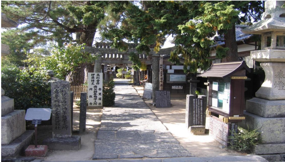
Figure 21: Enseiji, Hagi – a few helpful signs at the entrance