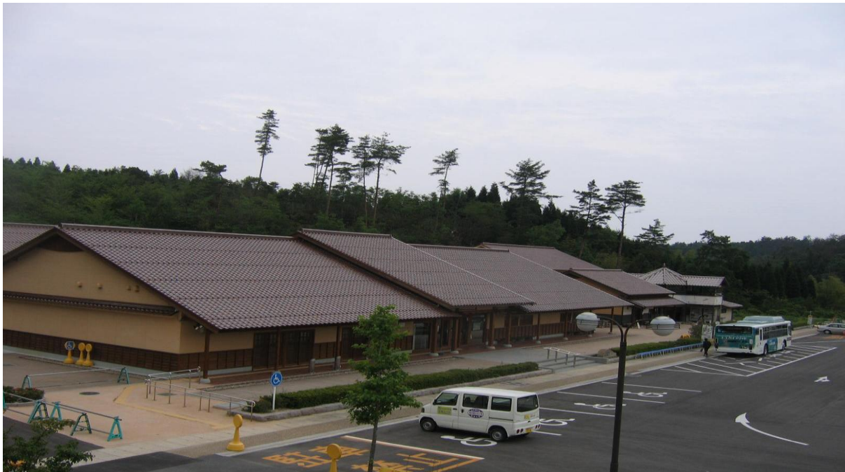
Figure 11: World Heritage Centre, Iwami Ginzan

“Iwami Ginzan – glittering once again” (Mokuji 2007). But Ōmori residents did not acknowledge this glittering and gleaming new image; they noted that it was not that the diorama was metal that conflicted with local values, but the fact that it was shiny and would not show age. Also, they generally do not think of their village as something seen by a bird from the air; it is much more intimate, enclosed within small, partly lit space. A local sculptor has his iron creations placed throughout the village, but these are accepted partly because they rust. The Ōda City government, however, has questioned the purpose of these sculptures and has considered whether they are appropriate under the various preservation requirements. One of their concerns was precisely the fact that these objects rust and are, therefore, unattractive. This contrast between wanting to present the place as shiny and new versus worn and old reflects a deep division in the understanding of place and how it should be expounded.