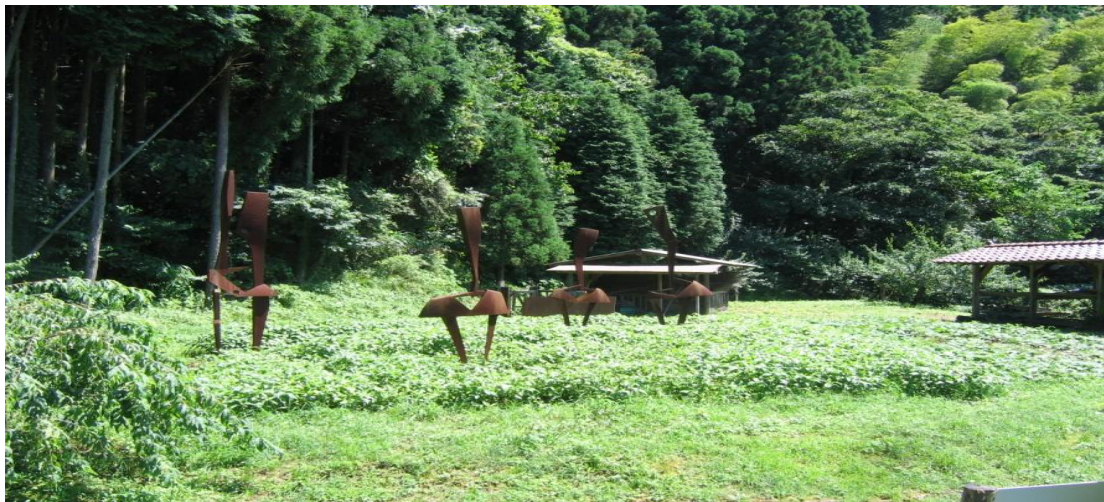
Figure 13: Rusted sculptures, Ōmori

Maps and signs, therefore, not only convey information based on different narratives about place; their materiality itself reflects attitudes and values. Posted maps and directional indicators are another type of signage found in the village that is now outside the direct control of individual residents. They preferred to mark location or publically present information in considerably more subtle ways in pre-World Heritage days. Even now, they will sometimes use a handwritten paper sign to indicate a shop is open and hang this on a chair in the street. Such modesty was unusual in Japan, and the intentional reluctance to display commercial messages now seems quaint. The lack of signs was certainly due in part to the fact that people in the village did not require indicators about places they already knew.