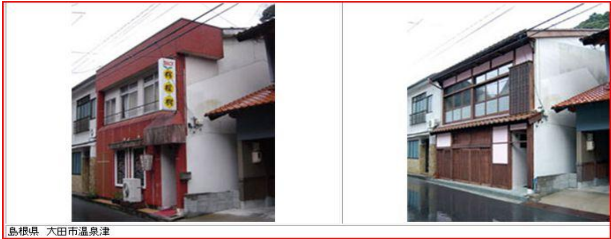
Figure 24: Yunotsu renovation, before and after 200

The Important Preservation District recognition is another tourist draw, but unlike Ōmori, Yunotsu is well situated to accommodate the new wave of tourists because of its long history of welcoming guests to its inns and bath houses. There is so much demand to get a piece of any World Heritage application to UNESCO that Japan has grouped increasingly disparate locations within each candidate. So, for example, prior to the Iwami Ginzan case, the preceding successful designation in 2004 was for the “Sacred Sites and Pilgrimage Routes in