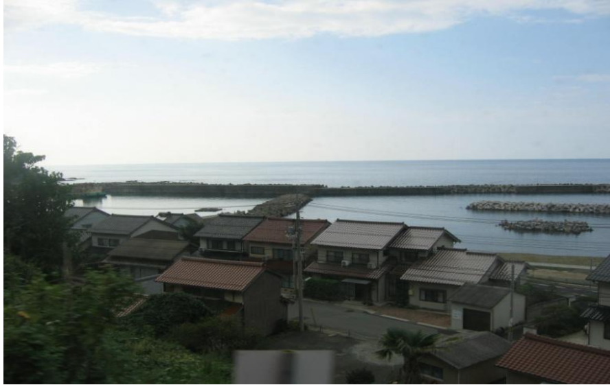
Figure 7: Tetrapods, Sanin Coast, Shimane