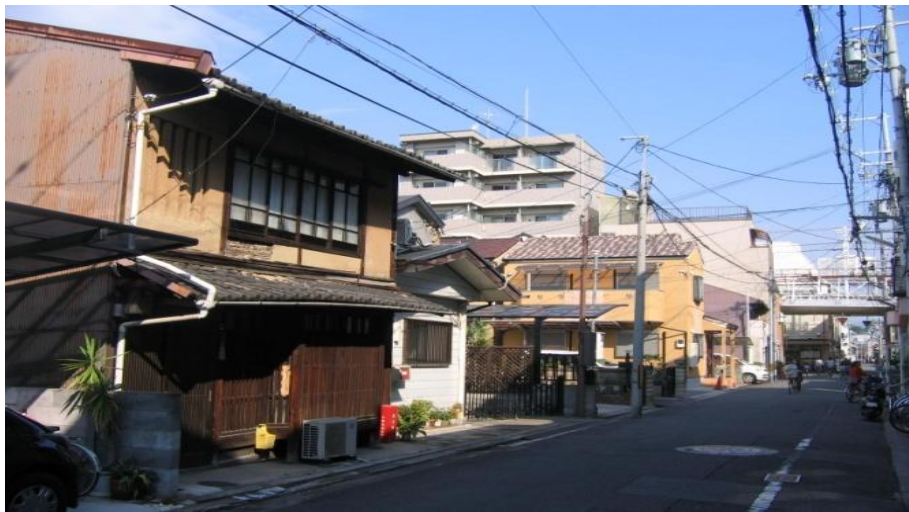
Figure 20: Backstreet scene, Kyōto, Nakagyō-ku, 2009

ring of conservation ( hōzon , 保存) around the outskirts that should maintain its historical and natural landscape; the central city that should be harmoniously ‘reclaimed’ and revitalized ( saisei , 再生); and a block running south from Kyōto Station that should ‘create’ ( sōzō , 創造) a space in which new urban functions are accumulated. Among the numerous problems this outline presents is the fact that many properties of recognized historical value, such as Nijō Castle, Nishihongan-ji and the Gosho (imperial palace), are located in the reclamation zone in the centre of the city.