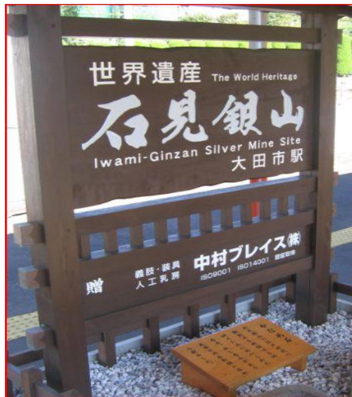
Figure 1: Nakamura Brace sign at Ōda Station