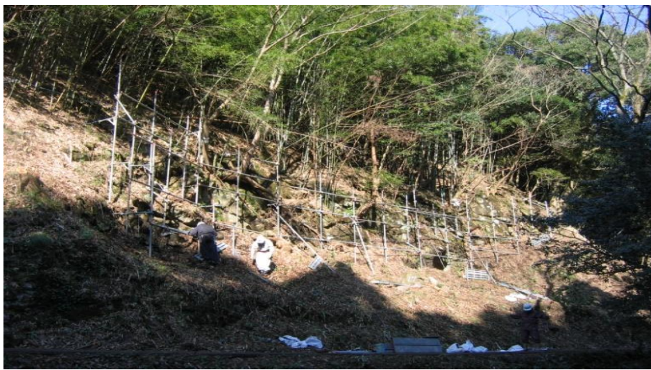
Figure 19: Protecting against dangerous rockslides by removing the trees, Ōmori

carried out without advance notice or consultation; these projects, like many of the building renovations underway, begin without warning to residents, who seem constantly surprised at the suddenness of construction activity. The ‘organic’ elements in the village, which have been added slowly over many years, did not occur in a rush; they accumulated by small accretions in an unpretentious way. They have been allowed to fit into the landscape as if there was a unifying consciousness selecting them. As we have stressed, however, different people have different opinions on to how to coordinate elements in the landscape. Some believe that too much coordination of a certain type results in bland standardization while others may not feel as strongly.