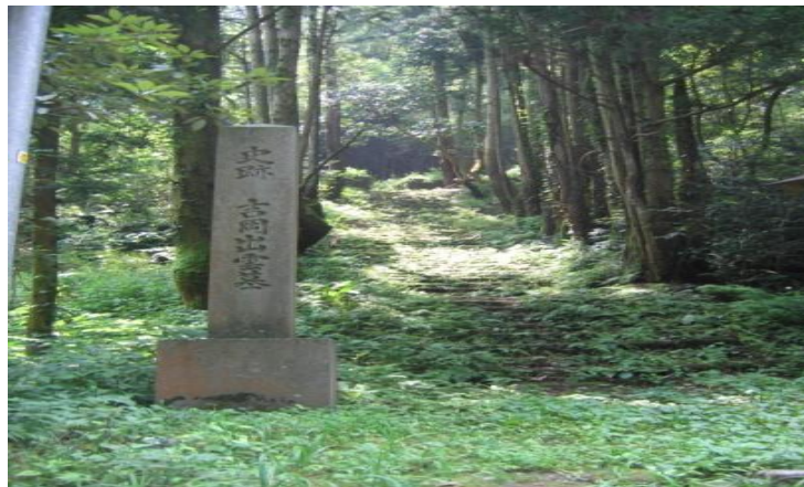
Figure 17: Mountain stairway and grave marker, Ōmori

according to the old Japanese lunar calendar (Iikura 2007: 20). 167 Such seasonal signals were a vital part of most landscape visions; a great many old photographs recorded community gatherings, particularly school graduations, which punctuated the annual schedule of life. Some of the food-related cycles would be familiar to most people in Japan, so that, for example, seeing persimmons drying in the autumn is ubiquitous. But some things like the elongated, red gumi berries that ripen in the forest in June are obscure. Because dwellings are porous to the outside world, perception of the sounds, smells, weather and light filtered through the surrounding fields and forests is heightened, at least for a city person. Certain natural occurrences, such as the peak period of firefly activity, arouse the interest of everyone, but frog croaking is hardly noticed.