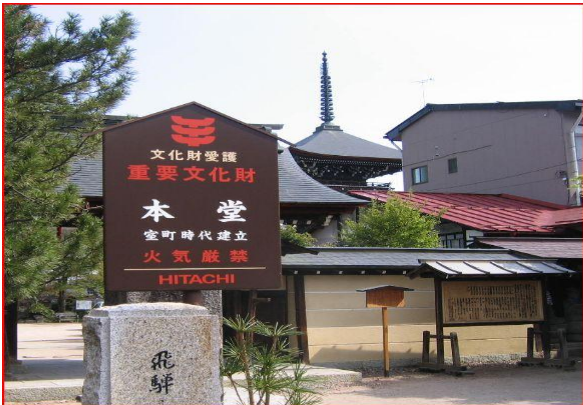
Figure 14: Protected cultural property sign sponsored by Hitachi Corp., Takayama City

Indeed, the contrast can be seen at many temples, shrines and well-known tourist sites in Japan, where corporations such as Hitachi supply signs that both identify a building and advertise the company. In other words, the identification of national cultural property has been made into a commodity. One local company now sponsors a large Iwami Ginzan display-board on the Ōda City train platform, and virtually all government offices in Ōda City still hang huge banners proclaiming their pride in World Heritage several years after designation. In general, there is concern that visitors need more information and the impulse at most tourist locations is to add more signs, displays and advertisements. There are temple gardens in Kyōto where every plant and tree is labelled, including tiny sprouts in moss gardens.