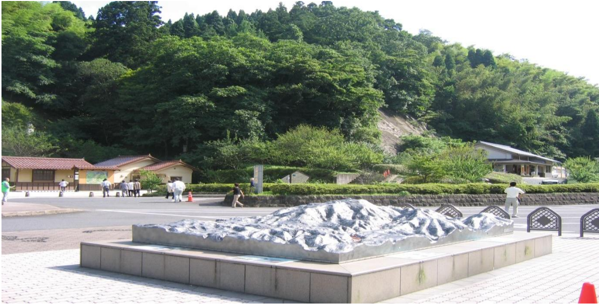
Figure 12: Diorama, Ōmori (note the metal guards near edge)