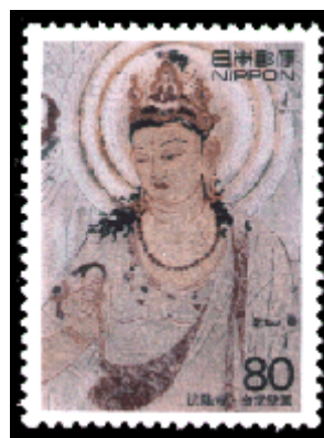
Figure 3: Mural of acolyte, Hōryūji, Nara, for World Heritage stamp series, 1995

the details of extant cultural property are accelerating. 116 Are the images or imagined ideals the basis for the determination of authenticity? Or is there a more substantial reality that needs to be considered? Japanese practice tends to approach the Brandi theory – appearance and verisimilitude to a particular model is the goal of most restoration work, particularly on built properties; it seeks attainment of an integral object. This approach ultimately leads to the creation of ‘virtual heritage’ and a blurring of the difference between a historical artifact and reproduction (Dave 2008). But Brandi also insisted that restoration work should be acknowledged and not hidden; while he approved of using any scientific technique available, it should not try to ‘reverse history’ and pretend that change has not occurred.