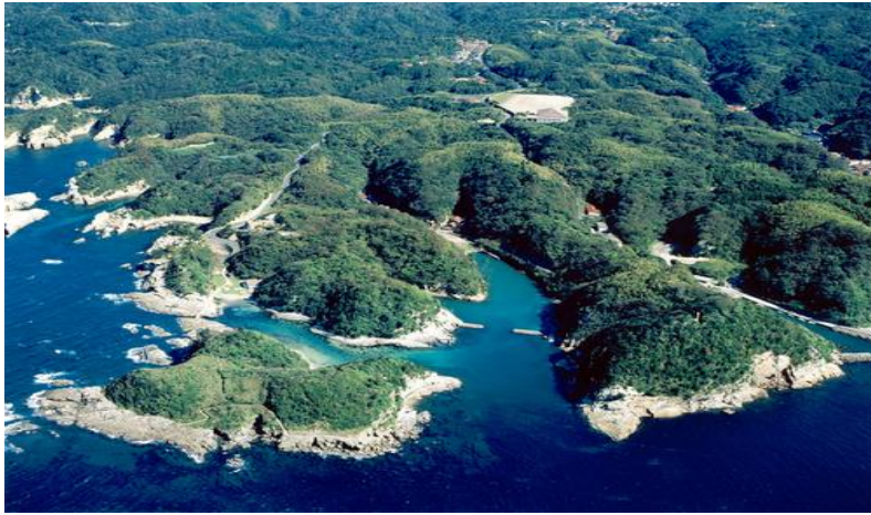
Figure 9: Coastline in Iwami Ginzan cultural landscape