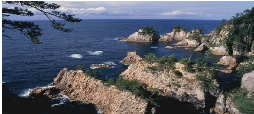
Figure 8: Sanin Coast for tourists, Uradome, Tottori. 158