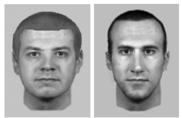
Figure 4. Example composites of the cricketer Simon Jones who plays for England. A composite constructed from a standard model (72 faces) is on the left; from a tailored model (50 faces), on the right.

Complete composites turned out to be identified slightly better from the standard (M = 31.8%) than the Tailored (M = 26.0%) model. However, tailored models (M = 32.3%) were much better identified than standard (M = 23.4%) for the more important, internal