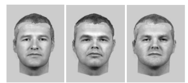
Figure 3. Example composites of the British footballer, Wayne Rooney. They were evolved from tailored models of size 30, 50 and 70 faces (from left to right).