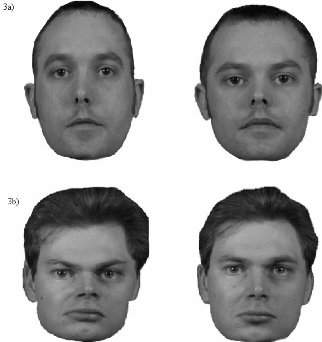
Figure 3. An example of two different faces changed along the caricature continuum (3a) and the oblique continuum (3b). The change shown is the same as a 100% change seen by the participants in this experiment.

Note that the Oblique and Caricature versions of a face will not in general be the same distance from the original: as drawn, the Oblique version of face A is closer than the Caricature version. However, because the faces are generated in pairs, the caricature version of face B will be the same distance from face B as the Oblique version of face A is from face A. Thus on average, the Oblique and Caricatured versions are the same distance from their original faces. We are concerned with determining which change is more detectable.