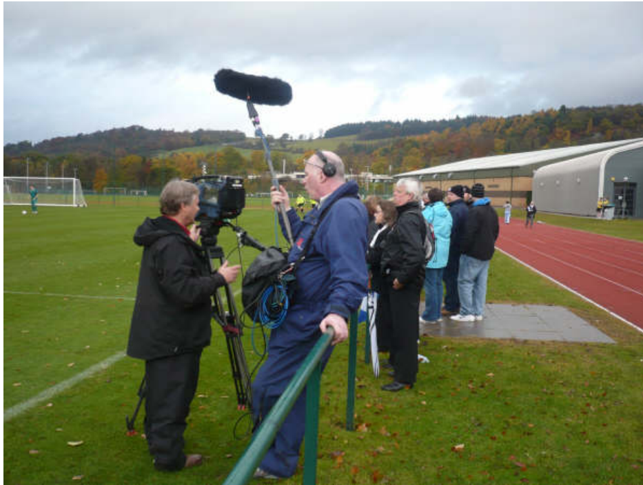
BBC Football Focus covering the Image Printers Club between The University of Stirling and Gretna (2008).