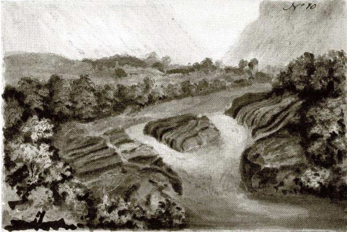
Figure 1: View of Glen Tilt (John Clerk of Eldin, 1785).

representing the glen as a sublime mountain wilderness and implicitly figuring himself and Hutton as heroic explorers: