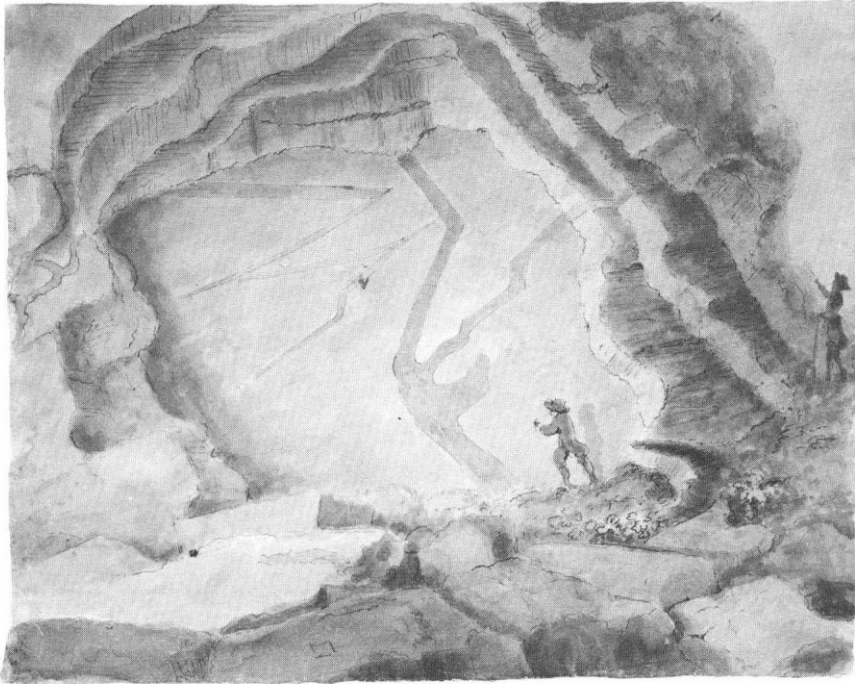
Figure 3: Granite veins exposed on Cairnsmore of Fleet (John Clerk of Eldin, 1786).

‘The drawings which Mr. Clerk took upon this occasion’ (p.47) is particularly interesting in the way it represents the relationship between these savants and this natural feature: