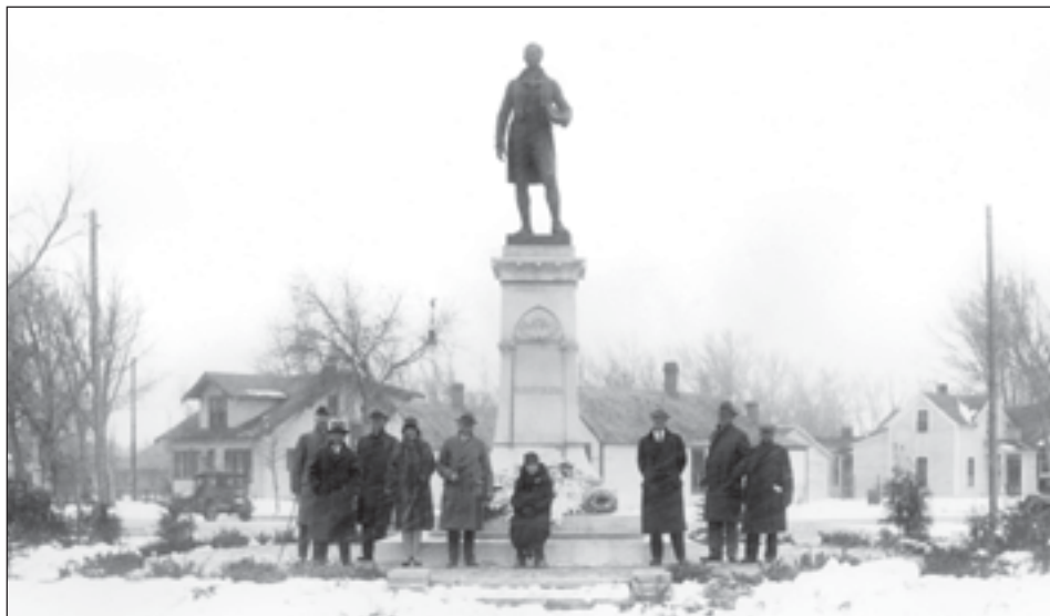
The dedication of the Robert Burns statue in Cheyenne, Wyoming, on November 11, 1929. Wyoming State Archives, Department of State Parks and Cultural Resources. Sub Neg 13178

Contact the editor for further reading on “Scots in Wyoming.”