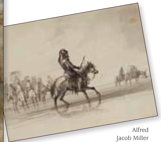
Alfred Jacob Miller (1810 – 1874). Jim Bridger in a Suit of English Armor , 1837. Joslyn Art Museum, Omaha Nebraska. JAM 1988 10 28 A

(Editor's note: The Buffalo Bill Historical Center has numerous paintings and sketches by Alfred J. Miller in its collection. Check them out on your next visit.)