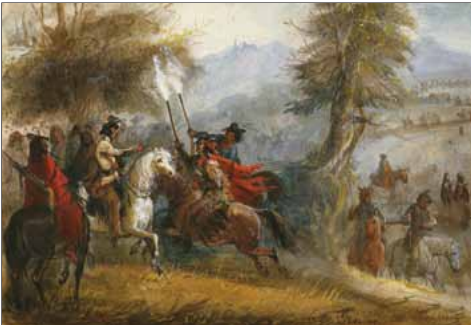
In Greeting the Trappers , ca. 1837, Alfred Jacob Miller (1810 – 1874) portrayed Stewart meeting trappers at the rendezvous. Watercolor on paper, 6.5 x 9.5 inches. Gift of the Coe Foundation. 8.70

At yet another Rendezvous, Stewart witnessed an operation conducted by Dr. Marcus Whitman to remove an imbedded Blackfoot arrowhead from the back of famed mountain man Jim Bridger. During the 1837