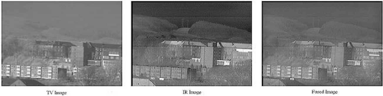
Fig. 3. Example of source and fused images.