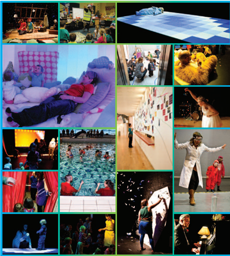
The Live Arts-Arts Alive © – Starcatchers and the University of Strathclyde