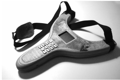
Figure 2 SMSlingshot