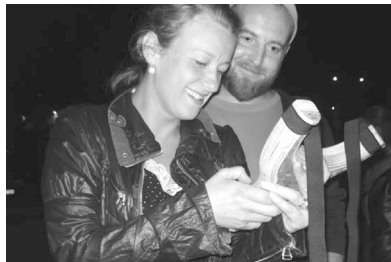
Figure 3 Random people interacting with the SMSlingshot