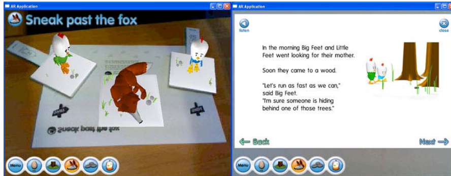
Fig. 2. Example for interactive screen (left) and text page (right)