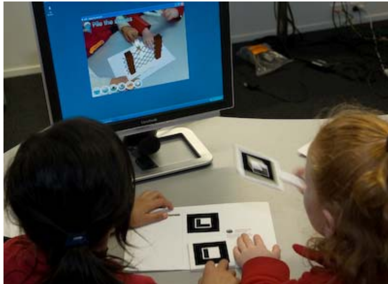
Fig. 3. Children interacting with the augmented book

Six pairs and six individual children 'read' and interacted with one of the two augmented books. During this phase two researchers were present and supported the children when they got stuck. Each story was read by three pairs and three individual readers. After completing the story, each child was interviewed individually following a semi-structured interview. As only the interview questions changed, we include the video data from our pilot study (two pairs) in our analysis. The children were videotaped with the written consent of their caregivers and the school. The videos have been analyzed by the authors in shared analysis sessions, taking extensive notes of children's actions, nonverbal behaviors, and talk. Analysis was open-ended, iteratively evolving and collecting instances of the issues we here report upon.