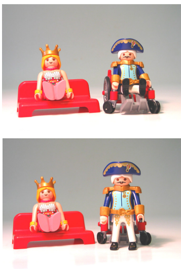
Figure 1: Example photos