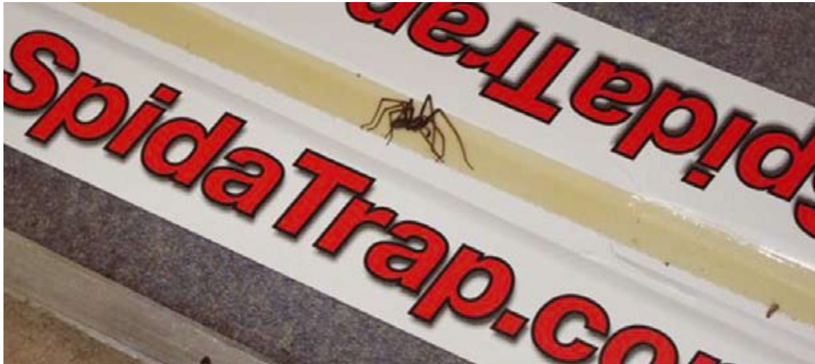
Sticky snare: SpidaTrap stops spiders in their tracks.

SpidaTrap.com make your home a spider free zone