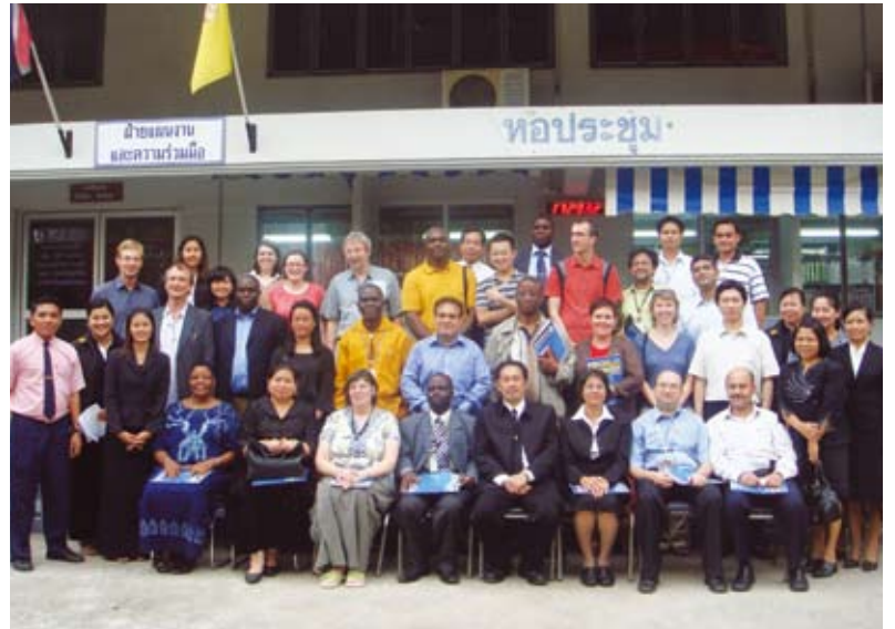
Eastern promise: The University of Strathclyde played an important role in an Inter-Regional Seminar on Entrepreneurship Education in Thailand in February.

An increasing number of countries recognise the importance of creating entrepreneurial culture and attitudes among young people, and UNIDO provides technical assistance to a number of developing countries to help them introduce entrepreneurship into the secondary curriculum.