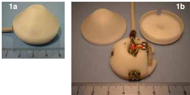
Figure 1: (a) one 3D gyroscope unit, (b) components of the plastic housing.

The 3D gyroscope system consists of three identical units (figure 1a) and uses a total of 9 single axis gyroscopes (Murata ENC 03JA). Each gyroscope unit holds three single axis gyroscopes securely at right angles to one another within a rigid plastic housing to allow the recording of angular velocity in three dimensions. The plastic housing (figure 1b) consists of an inner core to which the gyroscopes are mounted, a circular base, and a conical shaped lid.