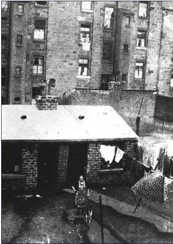
Wash house in back court of Springburn tenements, 1950s