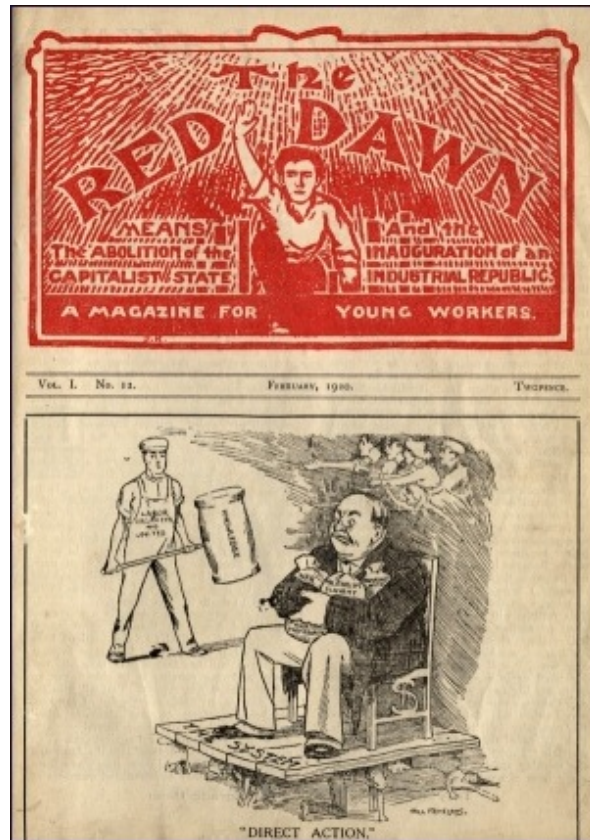
Cover of "The Red Dawn", the official organ of The Proletarian Schools and College, a syndicalist inspired magazine for young workers.

As a project, the GDL ran for two and a half years to the end of July 2002, with the following being amongst its more significant achievements: