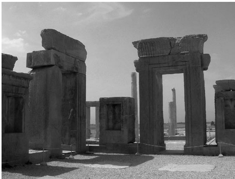
Among the seven ancient locations in Iran recognised by UNESCO as World Heritage Sites are the Palace of Darius at Persepolis, sacked by Alexander in 320BC and, nearby, the renowned site of the tomb of Cyrus, which held the first charter of human rights. (The author)

The hotel is run by a staff of between 20 and 25 who have to contend with working and sometimes living at high altitude, and to struggle against the associated climatic conditions. The hotel facilities include a lounge and bar area located on the first floor of the hotel, which offers a magnificent view over the snowy Tochal mountain peak. The lounge also contains a wide-screen television which seems to be constantly tuned to BBC News 24 ; the next plan is to offer wireless Internet throughout the hotel. The main restaurant has the capacity for 120 guests and serves both Iranian and international food; it doubles as a conference and seminar venue when required. There is also a self-service restaurant which, during the height of the season, serves over