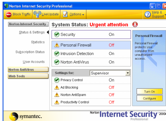
Figure 1 Firewall turned off to facilitate local network printing

Most organisations recognise the importance of user participation in security matters and this is often reflected in the establishment of company security policies and conditions of use. Such non-technical measures aim to engage the social and personal involvement of the local user community as a component in network and computer security.