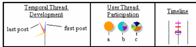
Figure 2: BulB Visualisation extracts