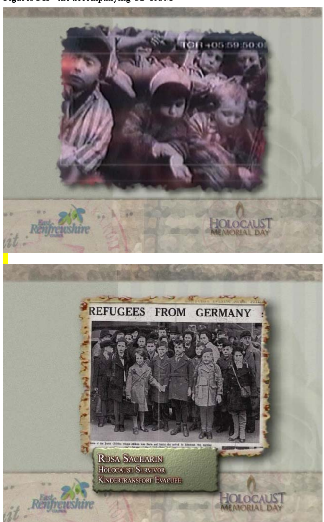
Figures I/II - the accompanying CD-ROM