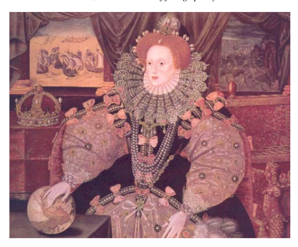
The 'Armada' portrait (c.1588) celebrates Elizabethan victory over the Spanish threat and wider imperial triumphs symbolised by the Queen's hand resting on the globe.